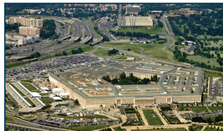
Pentagon LEED projects have recycled over 56,942 tons of construction and demolition debris and conserved over 17.8 million gallons of water.

The Department is investing more to improve the energy and environmental profile of its existing and new infrastructure. The Department's real property portfolio contains approximately 491,094 buildings and structures with a replacement value over $641 billion. To protect these assets and support its mission, DoD is committed to following the guiding principles for federal leadership in High Performance Sustainable Buildings. As a result, for recent renovations of the Pentagon, a 6.6 million square