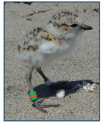
Twelve miles of VAFB beaches are designated Western snowy plover breeding habitat. Beach access is restricted 7 months per year and the plover population intensely monitored by the Natural Resources Team. This recently banded chick is part of the remaining 20% of the plover population; banding allows the Team to monitor breeding success and survival.

The Natural Resources Team also collaborates with CDFG in development of a comprehensive Invasive Plant Species Management Plan that rapidly locates, identifies and eradicates populations of incipient invasive plants before they spread onto public and private lands. This collaborative effort saves thousands of tax payer dollars by stopping the spread of invasives before large-scale infestation occurs. A fine example of this collaborative approach