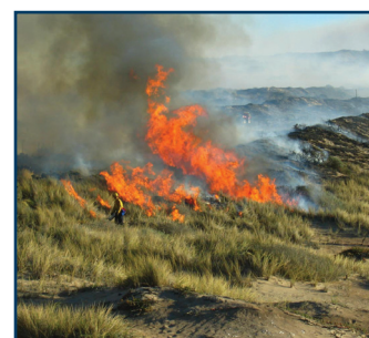
VAFB “Hotshots” in collaboration with the Natural Resources Team treated over 495 acres of invasive plant species with prescribed fire. This burn helped restore coastal dune habitat on VAFB to a suitable condition for Western snowy plover nesting.