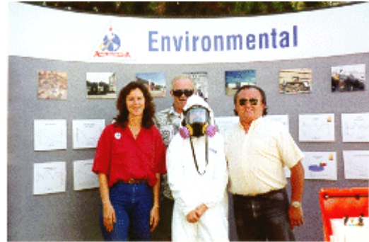
Earth Day 2001

Community Committees, Boards and Partnerships. The NADEP has a strong working partnership with its host Command, Navy Region Southwest, and with various local regulatory agencies and community groups. For the past 10 years, NADEP has participated in the annual San Diego Earth Day Event. This broad based environmental forum draws more than 60,000 visitors and provides NADEP with an opportunity to educate the general public about its environmental program and pollution prevention efforts. NADEP personnel visit San Diego City Schools to educate students on recycling and energy conservation issues. NADEP regularly participates in meetings and workshops sponsored by the Industrial Environmental Association, a local group of businesses,