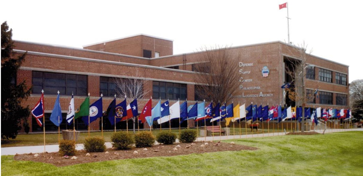
Defense Supply Center Philadelphia