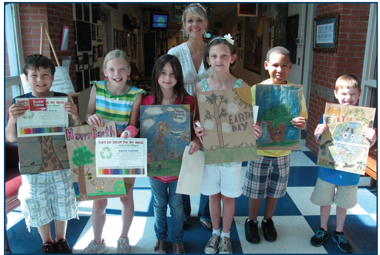
Every year, the Earth Day Grocery Bag Contest generates excitement and competition among students from a local community school. Bags are donated by the Base Commissary, decorated with earth conservation messages by students, judged by the RAFB environmental office, and returned to the Commissary for grocery bagging on Earth Day to spread environmental awareness. Awards are given to the winning artists.

Robins currently leads Earth Day outreach efforts that facilitate community involvement with interactive environmental displays, community participation in stream cleanups, nature walks, grocery bag art promoting environmental awareness in local elementary school students, and electronics and paper recycling days. Community members have repeatedly recognized the installation's commitment to sustaining our shared environment with superior accolades. In 2012, Robins was awarded the 18th consecutive Environmental Partnership Award from the Keep Warner Robins Beautiful Commission.