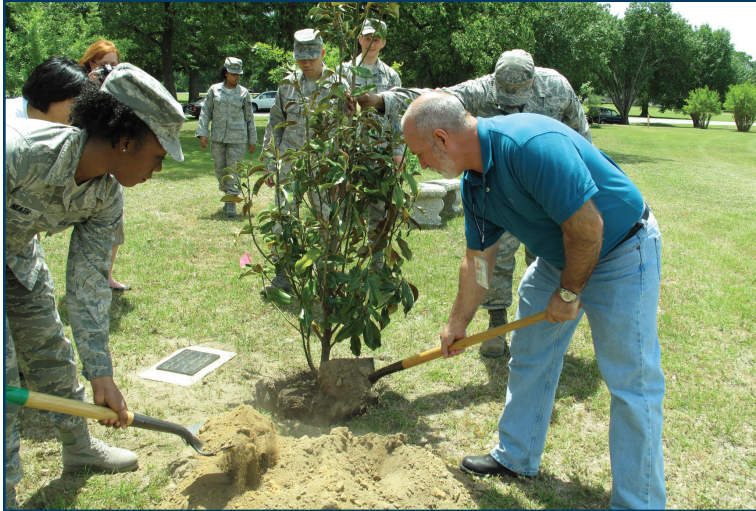
The entire community celebrates RAFB Tree City USA recognition with an Earth Day/Arbor Day Ceremony each spring, held at the Base Historic Forest. Trees planted in the forest are derived from seeds of trees located on properties once owned by notable Americans such as George Washington and Henry David Thoreau. There are currently 112 trees planted in the Base Historic Forest, most of which were planted as living memorials to deceased or retired members of the Robins Community

Community partnerships are ongoing with efforts to find, contain, and eliminate invasive plant and animal species. Between FY10 and FY12, Robins utilized contract support, the pest management shop, and volunteers from local scout troops and colleges to reduce populations of kudzu, alligator weed, English ivy, Chinese tallow tree, and wisteria. Volunteer trappers were also recruited to assist in our continued efforts to reduce the population size of troublesome feral hogs, capturing approximately 400 of these animals over a two year period.