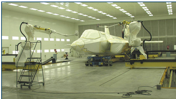
Pictured above is an F-35 Lightning II robotic painting work cell. The AOML coating system eliminates one layer when compared to the tradition paint system. This results in an overall aircraft weight reduction.

The PESHE for the F-35 program identifies the overall risk management approach (strategy, processes, and procedures) for the integration of ESOH considerations in systems engineering processes and contract solicitation with respect to the government's specific ESOH requirements for the program in the system requirements document, the statement of work, and the contract data requirements list. Regular System Safety Working Group meetings throughout the acquisition process are held to assess hazards and mitigate the associated risks to acceptable levels; these meetings are led by the System Safety Engineer, thus ensuring continuity of purpose and a centralized focal point for ESOH data management.