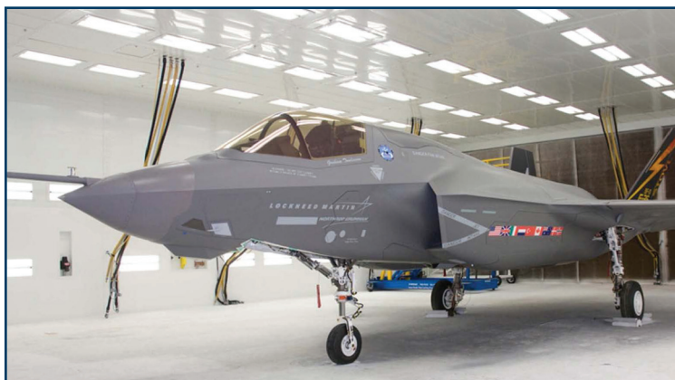
A newly painted F-35 sits inside a paint booth at Air Force Plant 4. The AOML coating is projected to more than double the coating system refresh cycle. This results in over a 50 percent reduction in the paint/de-paint waste stream.

be documented in the PESHE as a serious or high risk. Far field noise was subsequently identified in the revised PESHE update as a serious risk, requiring mitigation and acceptance of the residual risk by the appropriate decision authority. The team also identified needed improvements to the NEPA compliance schedule.