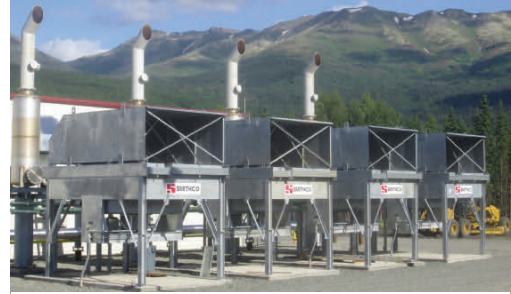
The JBER Landfill Gas Waste-to-Energy Plant was constructed with 4 generator units designed to run on methane gas produced by the breakdown of wastes buried in the landfill.

JBER's initiatives allow for a sustainable base where less funding is spent on waste and energy, and more on training our Soldiers and Airmen to carry out their missions.