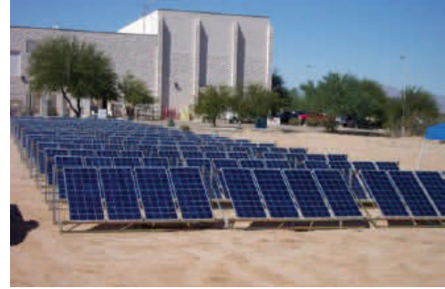
Over the past two years, the AZARNG expanded the use of its most abundant natural energy source: sunlight. The AZARNG's solar projects create over 1 million kilowatts of energy each year.