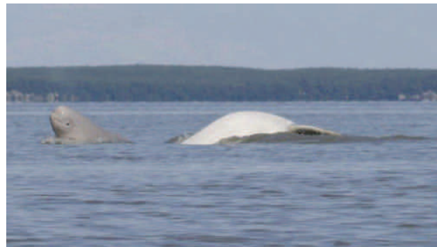
Military training and a sustainable environment are not mutually exclusive. A beluga whale calf and mother were observed in Eagle Bay, just outside the coastal boundary of Eagle River Flats, an Army impact area.