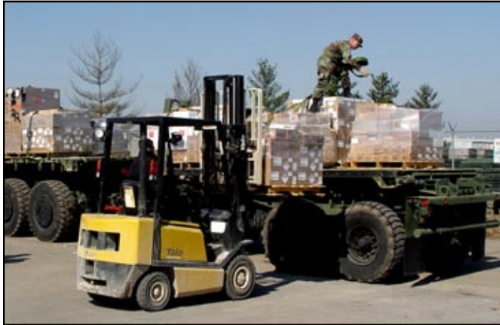
The PPOC packaged 1,100 different hazardous materials required for mass deployment of over 20,000 personnel.

minimal HAZMAT is available to the Soldier at all times. In FY 2005, the PPOC ordered, managed and packaged 1,100 different hazardous products required for the mass deployment of over 20,000 personnel. Commanders reported a 25 percent increase in combat readiness as a result of the contingency operations program. After deployment, PPOC service specialists closed 553 unit hazardous material storage lockers, waste lockers and other areas of environmental concern and managed these materials in the centralized facility.