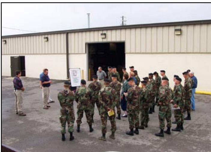
Educational Tours: Soldiers tour the Pollution Prevention Operation Center (PPOC) after receiving EMS training. The PPOC conducts 20 two-hour facility tours for units, commanders, students and civilians every year. Twelve environmental programs are featured within the tour emphasizing waste minimization through proper management and affirmative procurement.

Fort Campbell lies on the Kentucky-Tennessee border between Hopkinsville, Ky., and Clarksville, Tenn. Residents at the fort share in the heritage of two states rich in history and natural resources. They also share in the challenges inherent in the growth of communities surrounding the installation. Fort Campbell is valued as an important part of the economic development surrounding Clarksville and Hopkinsville, and as a member of their communities.