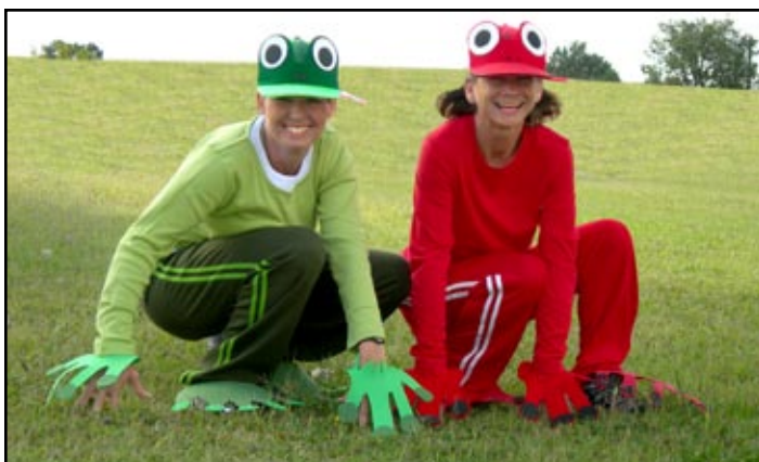
Fanny and Freckles teach stormwater, pollution prevention and recycling lessons to kids.

Fort Campbell is on the forefront of integrating the EMS into an already well-established and robust environmental program. Every year Fort Campbell realizes successes that have received recognition from military and civilian organizations. FY 2005 was especially productive for Fort Campbell’s environmental program, evidenced by successful implementation of the EMS, mission support through efficient HAZMAT management, substantial savings and avoidances in pollution prevention measures, extensive training and education initiatives and more. Fort Campbell personnel are proud of the role they play in the nation’s defense.