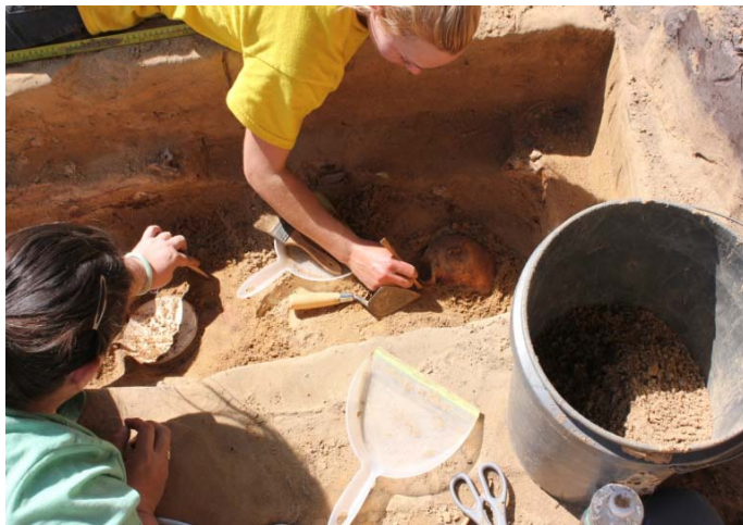
In situ investigation of a 19 th century burial at HAAF.

In FY12 the installation investigated an unmarked cemetery at HAAF which was slated for aviation support and parking. Using methodology developed from previous cemetery investigations, the installation augmented the preliminary cemetery investigation through an integrated team of installation support to fully assess the extent of the cemetery and realize a cost avoidance of approximately $750,000. As a result, CRM established accurate cemetery boundaries and estimated burial densities, and then encouraged project proponents to avoid the cemetery for an in situ cost avoidance of $525K.