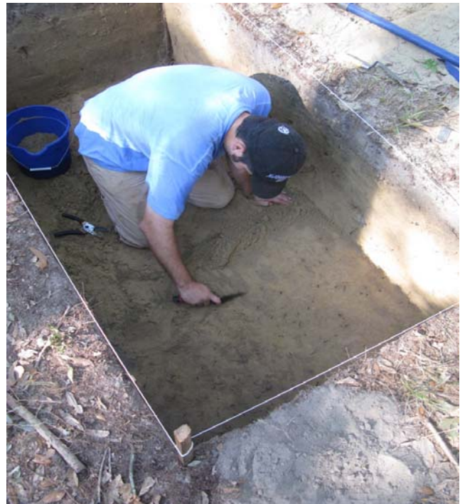
Phase II Archaeological Site Testing efforts to further reduce training land encumbrances and manage resources effectively.