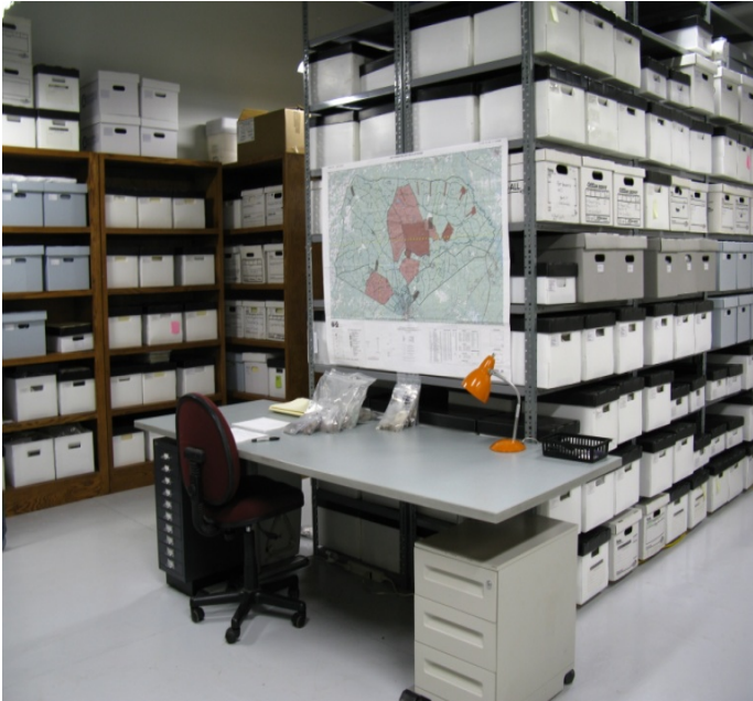
FS/HAAF's 625-square foot climate-controlled Curation Facility.

ensures that the artifacts and data are held up to federal standards which allows efficient research for CRM, outside researchers and the interested public. Tens of thousands of dollars are saved by the installation each year by on-site curation that would otherwise be diverted to private facilities.