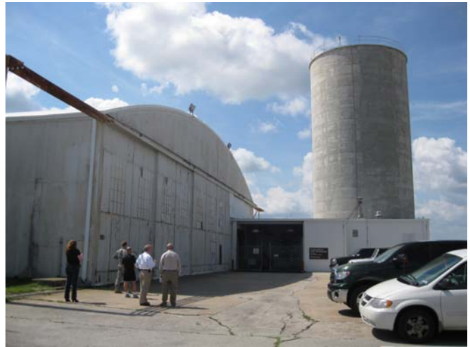
Adaptive Re-use and rehabilitation of Building 1206, HAAF's original civilian hangar constructed in 1936.

interest in relocating the structure on its property should the military wish to demolish it. As result, USACE plans to encapsulate the original outside material with similar metal paneling which will largely preserve the original exterior appearance. This Secretary of Interior's Standards adaptive-reuse approach will not only leverage the installation's mission of stewardship but also provide opportunities for future alternative mitigation strategies should they become necessary.