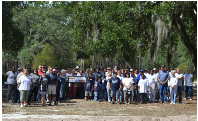
Participants in the Little Creek Cemetery National Public Lands Day cleanup pose in front of a newly-installed interpretive sign.

format. Engaging stakeholder participation, CRM is now developing "The Scrapbook," a webpage featuring pre-military historic documents, photos, and real property records for the installation area, partially provided by the general public, and partially provided by the installation. Through all these efforts, the installation preserves the history of the communities that were displaced by the Army in 1941. In return for their sacrifice, the installation commemorates the rich historical legacy of these people.