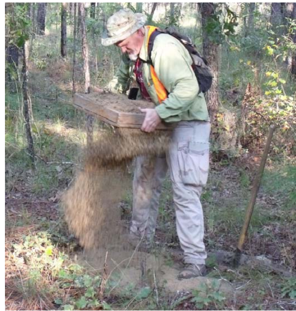
Phase I Archaeological Inventory in support of training & timber thinning requirements.

of training lands are encumbered by cultural resource concerns. Of the 4,000 known archaeological sites, 50 are listed on or eligible for the National Register of Historic Places (NRHP), while 379 need further evaluation, reducing training lands encumbered by protected CRM sites to only 0.27% of FS and 0.03% of HAAF. Because of the near-completion of survey, CRM will soon change from a survey to a testing management posture, with the next step being an aggressive push to evaluate all potentially eligible sites.