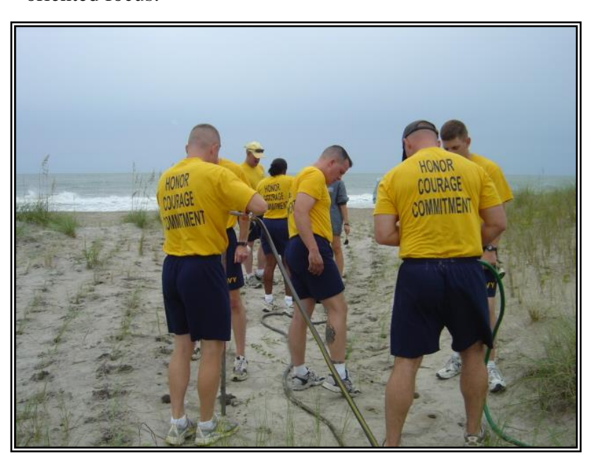
Camp Lejeune's Onslow Beach provides the most diverse amphibious training opportunity within the Armed Forces. The sustainability of Onslow Beach is critical to the Marine Corps and the future of expeditionary forces.

diverse and sometimes competing interests at Onslow Beach were leading to conflicts between military training, recreational use, and threatened species protection efforts. As highlighted under accomplishments below, Camp Lejeune continues to make positive strides in maintaining a mission oriented focus.