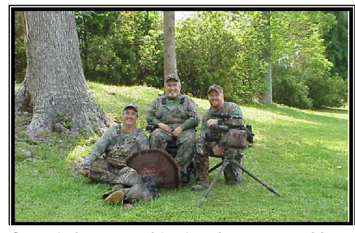
Camp Lejeune provides hunting opportunities on 102,000 acres of land. Each Spring, hunters on Base harvest an average of 25 gobblers.

Marine Corps Base, Camp Lejeune's revised Integrated Natural Resources Management Plan (INRMP) provides major program changes for various conservation related activities. Endorsed by State and Federal natural resource agencies the revised INRMP improves military training opportunities while also providing a greater level of protection for sensitive species. In 2004, Camp Lejeune formed a Conservation Working Group (CWG) to address the integration of natural resource conservation issues and military training. The CWG convenes every two months or as