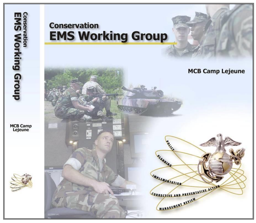
Camp Lejeune implements EMS EO 13148 in an integrated framework to address pressing environmental issues facing the Installation. All of Camp Lejeune's EMS Working Groups reach high into the branches to find effective and regulatory compliant solutions to reduce impacts to the mission.

During FY2006, the CWG tackled a number of significant issues for Camp Lejeune to include bird/animal strike hazard (BASH) mitigation, minimizing impacts to training from archaeological resources,