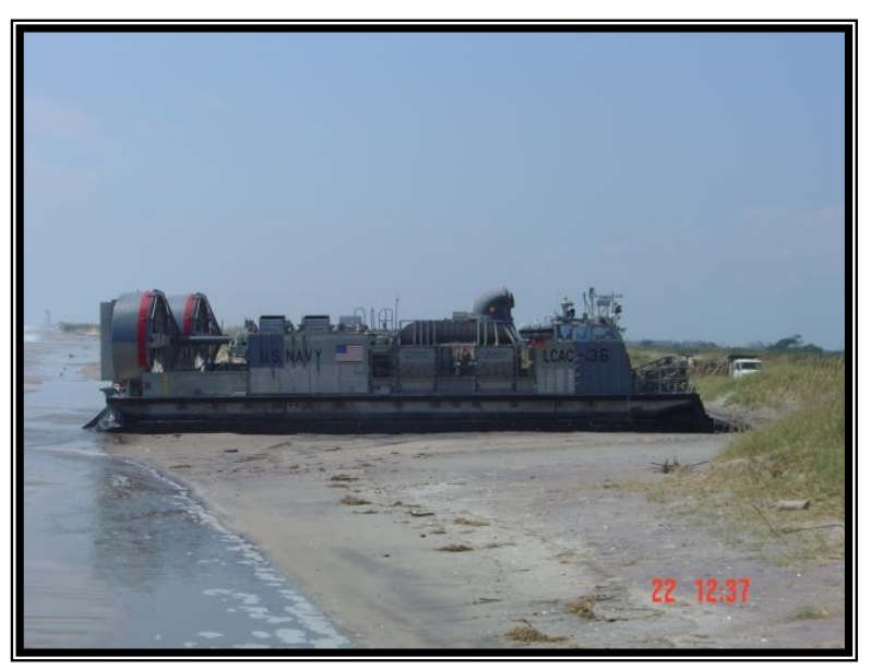
Camp Lejeune's Onslow Beach provides the most diverse amphibious training opportunity within the Armed Forces. The sustainability of Onslow Beach is critical to the Marine Corps and the future of expeditionary forces.

The Environmental Conservation Branch (ECON) is charged with INRMP development, implementation and revision, continues to evaluate and analyze long-range planning, project implementation, along with other emerging requirements. The ECON Branch, with a combined staff of 40 professional and technical personnel (consisting of civilian employees, interns, and contract support) is well structured to lead INRMP implementation. ECON includes professional wildlife biologists, professional foresters, National Environmental Policy Act staff, an archeologist, and conservation law enforcement staff.