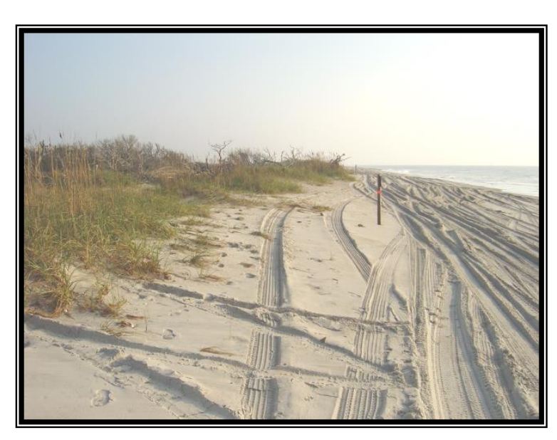
Vehicle use patterns, as seen in the above photograph, demonstrated the need for tighter controls on recreational vehicle access to Onslow Beach. Base Directives were revised to protect fragile island resources while permitting recreational uses during low impact months of the year.

training capability. Natural resources managers initially identified known species at risk and natural community type locations on Camp Lejeune and presented these, with recommendations for protection, to the CWG. Through a dialogue with Training & Operations representatives and other interested parties, a new Base Order was developed for Command endorsement that ensured continued viability of several at risk species and provided a measure of protection to sensitive natural community areas.