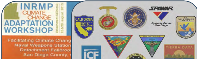
Det Fallbrook's INRMP Climate Change Adaptation Project

The station, along with Seal Beach National Wildlife Refuge, hosts an annual event with the objective of restoring native vegetation to several acres of salt marsh and upland habitat. NPLD proved once again to be an ideal opportunity to involve the community. Volunteers included station personnel, Boy Scout and Girl Scout troops and students from local schools.