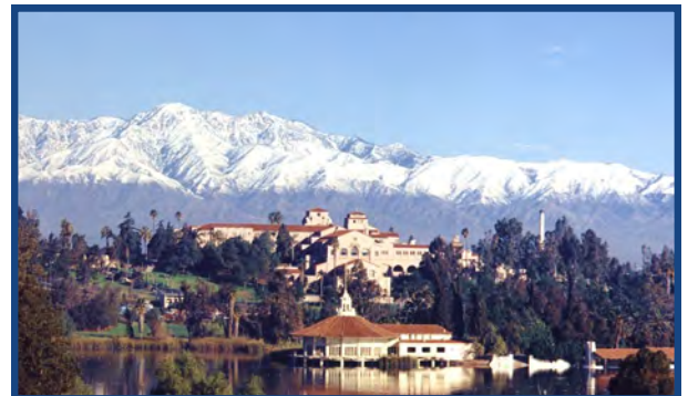
Historic Lake Norconian Resort at Det. Norco