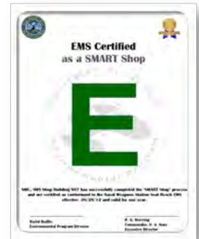
The Green E Symbol of Sustainability

The Green E is issued once the SMART Shop is certified "EMS Conformant" by the IEPD and Executive Officer. The certificate is valid for one year, until the next annual review.