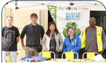
America Recycles Day Sustainable Solid Waste Program

The Installation SSW Coordinator and Recycling Team partnered with Environmental staff to promote waste diversion and recycling throughout the two year period, events such as 5K runs and Earth Day. The America Recycles Day event focuses on a e-waste recycling round-up, and was successful at diverting 21K lbs. in FY12 and FY13 combined.