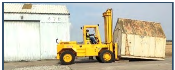
SSW Program Recycles a Metal Shed