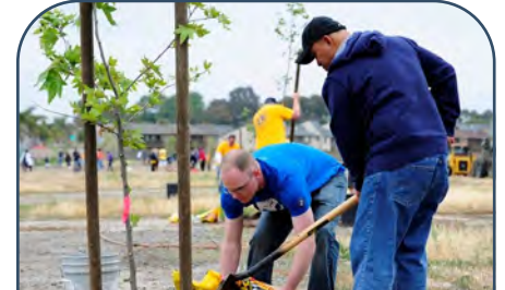
National Public Lands Day

The Environmental staff participates with equipment deployments to support the Area Plan for oil and hazardous substance releases. The base provides boom storage and anchoring for federal and state spill response organizations. Pictured here: equipment deployment exercise involving Marine Spill Response Corp, Coast Guard, and State Fish and Game.