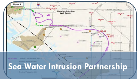
Sea Water Intrusion Partnership

The Integrated Natural Resources Management Plan (INRMP) Climate Change Adaptation Project focuses on Detachment Fallbrook as a case study to use the best available scientific data, subject matter experts, and regional stakeholders to assess the potential impacts of climate change on natural resources and identify methods for incorporating climate change adaptation planning into DoD INRMPs. A key element of the climate change adaptation project culminated in a two-day workshop that was held at Detachment Fallbrook in August 2013 with key collaborators and regional participants.