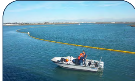
Area Plan Spill Response

The Installation SSW Coordinator and Recycling Team partnered with Environmental staff to promote waste diversion and recycling throughout the two year period, events such as 5K runs and Earth Day. The America Recycles Day event focuses on a e-waste recycling round-up, and was successful at diverting 21K lbs. in FY12 and FY13 combined.