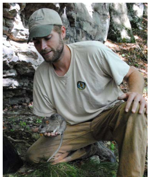
Camp Dawson's NRC Manager handles an adult Allegheny woodrat prior to release. NRC staff conduct yearly mark and recapture surveys to track populations on the training areas. Individuals are sexed, aged, weighed, and marked with PIT (Passive Integrated Transponder) tags for identification.

Camp Dawson consults with USFWS to manage for the Indiana bat, timing tree removal to the bats' lifecycles. The NRC program completes habitat assessments