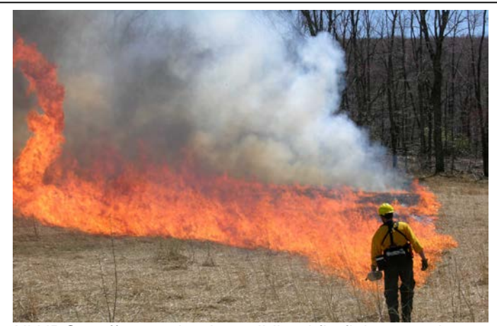
All NRC staff are trained as wildland firefighters and complete prescribed burns in-house with the approval of the WV Division Forestry. Camp Dawson was one of the first installations to complete an approved integrated wildland fire management plan back in 2007. In addition to reducing wildfire fuel loads, the program focuses on native grasslands, using fire regime rotation to help grasses thrive and control invasive species encroachment.

prescribed fire activities, avoiding the need for contracted burn crews. The program is well-established: Camp Dawson was one of the first installations to complete an approved integrated wildland fire management plan back in 2007. In addition to reducing wildfire fuel loads, the program focuses on native grasslands, using fire regime rotation to help grasses thrive and control invasive species encroachment. Parcels ranging from 20 to 50 acres are managed with fire each year. Currently, the installation is building its own fire department to be integrated with the wildland fire program. Volunteer firefighters from the community also assist on some burn events, along with trained university interns.