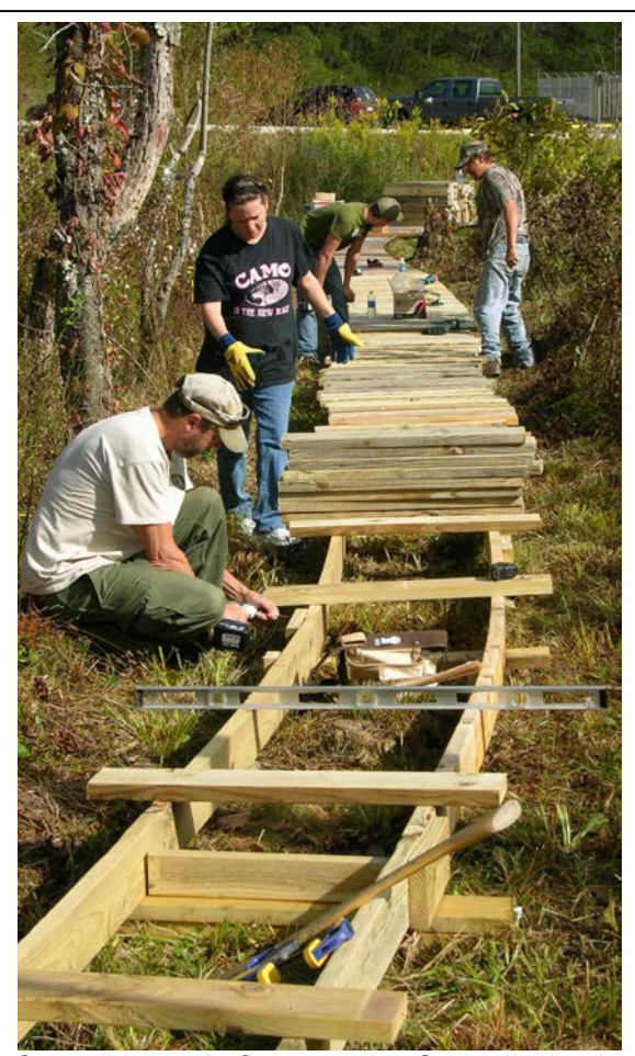
Camp Dawson's Conservation Specialist leads local volunteers in the construction of a wetland boardwalk during National Public Lands Day. The now completed loop stretches half a mile and includes a 640 square-foot deck and picnic area. Interpretive signs alert visitors of unique wetland flora and fauna.

The installation's collaboration with Friends of the Cheat River and DNR also benefits the entire region in improving water