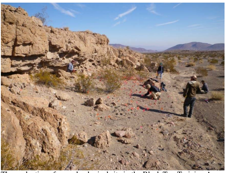
The evaluation of an archeological site in the Black Top Training Area contributed to the completion of the 5-year ICRMP goals almost two years early.