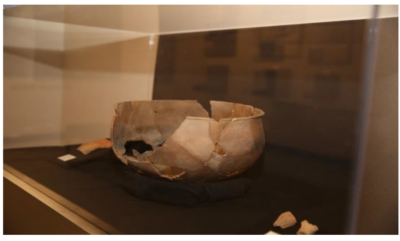
This pot, dropped up to 1500 years ago by its owner, was carefully reconstructed to allow exhibit visitors to see an almost complete vessel, a rare find in the desert.

Band of Cahuilla Indians, the Fort Mojave Indian Tribe, the Colorado River Indian Tribes, the Chemehuevi, the Twentynine Palms Band of Mission Indians, the San Manuel Band of Mission Indians, and the Morongo Band of Mission Indians.