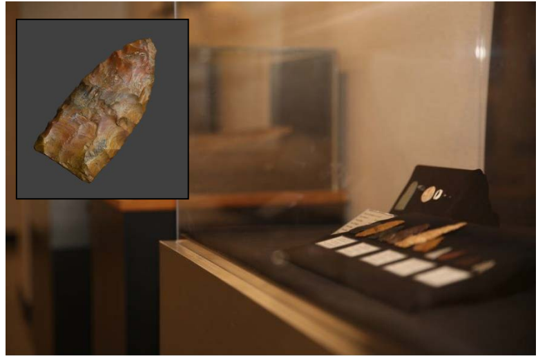
The discovery of a Clovis projectile point (inset) aboard the Combat Center has pushed the possible occupation dates in the region back by up to 2,000 years, triggering an update of the interpretive displays in the Archeology and Paleontology Curation Center.

In FY15 the Curation Center staff updated the prehistoric displays to incorporate one of the newest accessions: a Clovis projectile point found on the base. This rare find likely dates to 11,000 to 13,000 years before present, and extends the documented occupation of Combat Center