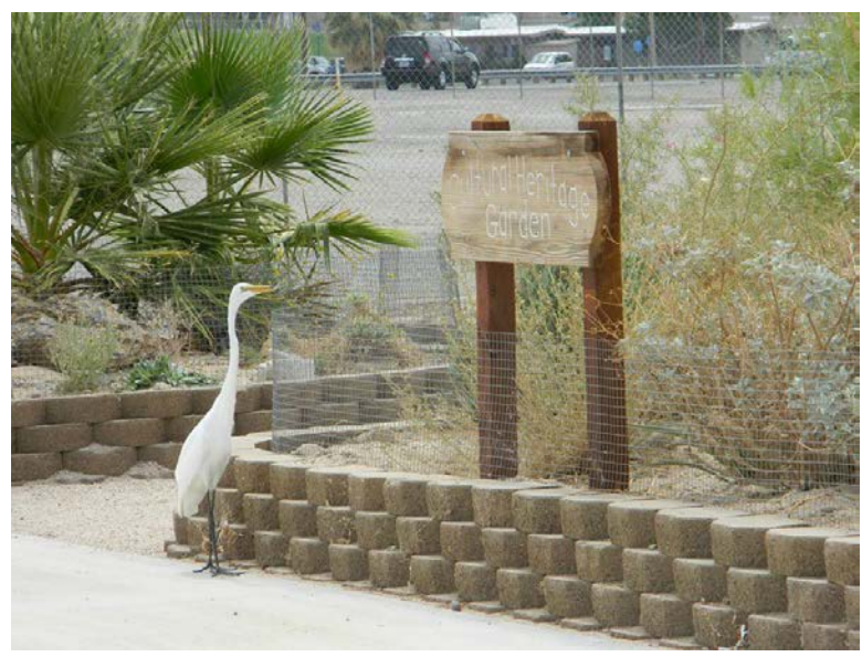
A visitor from the adjacent Wildlife Viewing Area takes a break at the Cultural Heritage Garden. The garden helps educate Marines, Sailors, and other visitors on plants used by Native Americans.

The Cultural Resources Section continues the practice of widely distributing all cultural resource project reports, as it has since 1995. Report recipients include the Fullerton Archaeological Information Center; Joshua Tree National Park, and Native American Tribes affiliated with Combat Center lands. During FY2015 and FY2016 the Curation Center staff provided 75 tours of the facility. Visitors included Navy and Marine Corps personnel, the Joshua Tree National Park archaeological staff, the new Commanding General and his staff, the Deputy Assistant Secretary of the Navy, 27 severely handicapped