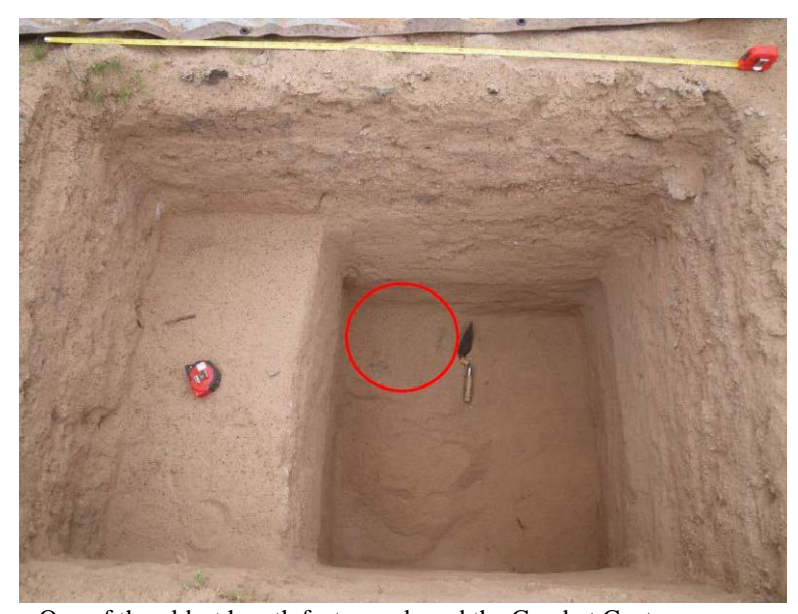
One of the oldest hearth features aboard the Combat Center was recently uncovered on the western margin of the Pisgah lava flow. This represents one portion of a growing body of data that suggest this area may preserve some of the earliest evidence of local huntergatherer occupations.

Constructed to meet Federal standards for curation (36 CFR