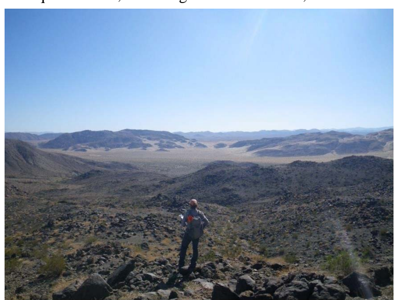
A continuing priority for the Cultural Resources Section is the archeological inventory and evaluation of recently acquired lands, including the vast area in Johnson Valley.

component, and 135 prehistoric sites. Ninety-four of these sites have been evaluated, of which 17 have been recommended eligible for the NRHP. The addition of more than 105,000 acres of land to the Combat Center, and the occurrence of cultural resources that may be eligible for listing in the NRHP, has triggered the need for a new Programmatic Agreement (PA) and ICRMP. The Combat Center is currently consulting with both the California State Historic Preservation Officer (SHPO) and the Advisory Council on Historic Preservation (ACHP) on a revised PA and ICRMP.