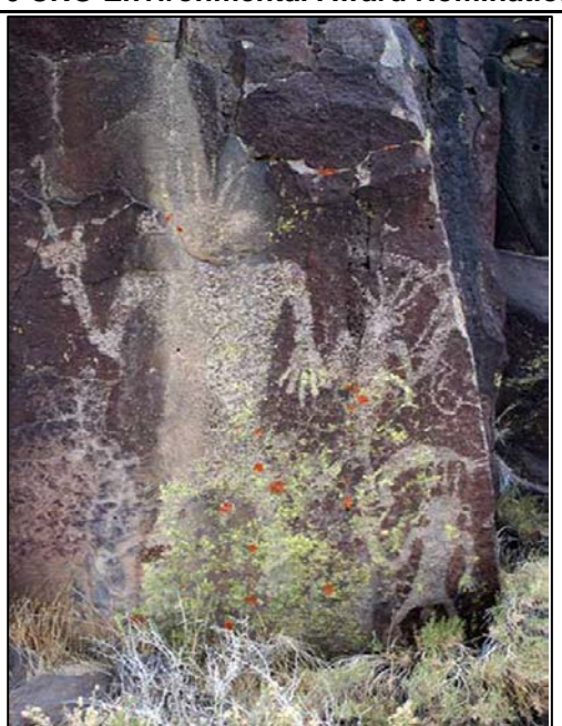
Anthropomorphic figure located in Dead End Canyon.

It should also be also noted that much of the computer programing and software development was custom produced, requiring international cooperation from several gaming and photographic software designers to complete.