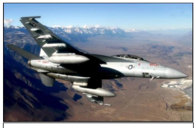
Flight Mission Over NAWS China Lake

The installation was established as the Naval Ordnance Test Station (NOTS) on November 8, 1943 as a partnership between the Navy and California Institute of Technology for the testing and evaluation of rockets and other aviation ordnance. This partnership and interaction between civilian scientists/engineers experienced military personnel has made China Lake one of the preeminent RDAT&E institutions in the world.