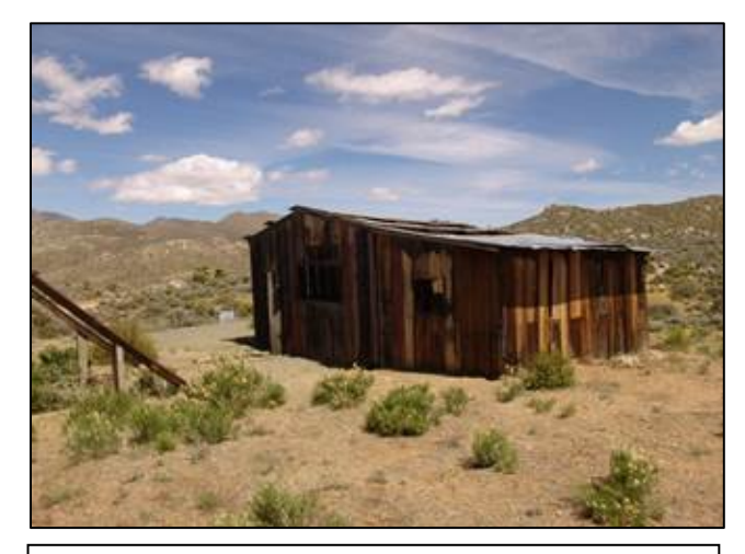
Historic Cabin located in the area of Cactus Flat.

In FY 2015/2016 China Lake participated in the City of Ridgecrest's Annual Petroglyph Festival. began in 2015 under the festival coordination of the City of Ridgecrest and was designed to draw people from around the in order to diversify the United States economy. The China Lake Cultural Program provided guides through Little Petroglyph Canyon and Seep Springs. The guides provided a general narrative on the possible age of the rock art, various theories related to the function of the rock art, and ensured that there were no impacts to the resources.