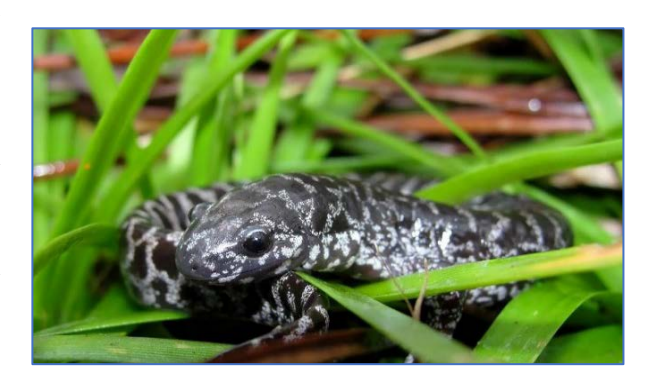
Endangered Species Management The NRT is focusing efforts on balancing the protection, conservation, and enhancement of Flatwoods salamander populations while maintaining mission sustainability. Aggressive habitat management efforts coupled with continued refinement of the head-starting methodology is leading the way to speedy recovery of the species.

protection, conservation, and enhancement of Flatwoods salamander populations maintaining mission sustainability. More than 7,000 linear feet of wire fence has been installed in response to feral hogs degrading wetlands and threatening vital salamander breeding habitat. An additional six potential breeding ponds have been or are being restored to encourage occupation and suitability for reproduction. Most noteworthy is successful use of managed natural populations to rear salamanders for reintroduction or repatriation into unoccupied habitat. This headstarting program involves rearing salamander larvae in cattle tanks that contain all necessary natural elements needed for larvae survival while reducing or eliminating elements that tend to decrease larval success. Aggressive habitat management efforts coupled with continued refinement of the head-starting methodology has been a collaborative effort between the Eglin NRT, FWC, USFWS, and Virginia Tech University. Once again, the Team is paving the way for species recovery and reducing the likelihood of lengthy and costly consultations with regulators that can impact testing, training, and other mission readiness activities.