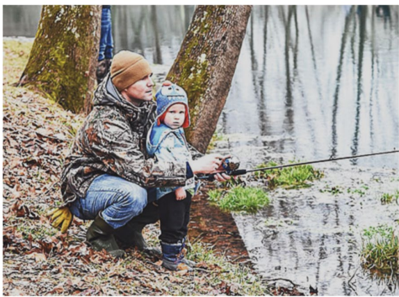
Environmental staff members were on hand at Kid's Trout Fishing Derby to bait hooks, and to teach the importance of natural resources and clean water.

In FY18, FLW planned and implemented a pilot program for urban archery hunting within the FLW cantonment area to reduce deer/vehicle collisions, deer damage to landscaping and gardens, potential human disease issues through reduction of tick populations and to provide additional hunting opportunities. The new hunting program required extensive planning and outreach to ensure the hunt was publicly acceptable and could be safely conducted. Rules and safety procedures were developed and all hunters were required to complete a face-to-face safety briefing. Outreach for the hunt was conducted through flyers, newspaper articles, meetings, and iSportsman website notifications. The pilot program proved to be very successful and was re-authorized with lessons learned for the 2019 hunting season.