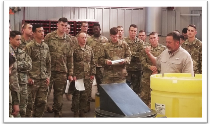
DEI instructs a class of captains and warrant officers on environmental laws.

FLW synchronizes environmental concerns and