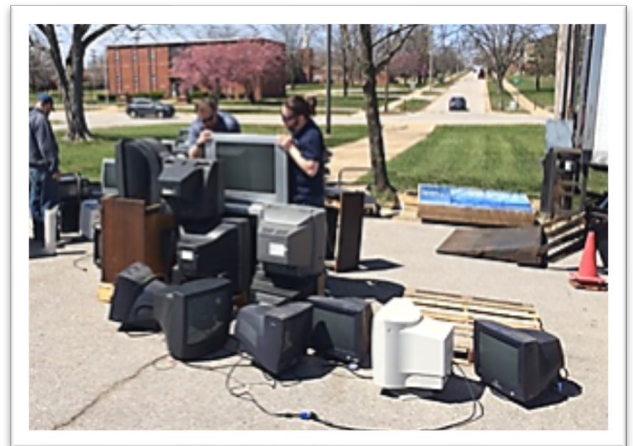
A portion of the record 197 unwanted televisions recycled during FLW’s two E-waste events in FY19.

The QRP supports the service men and women with twice-yearly electronics recycling events held in conjunction with Earth Day (April) and America Recycles Day (November). These events provide opportunities for residents to recycle their privately-owned consumer electronics and small appliances.