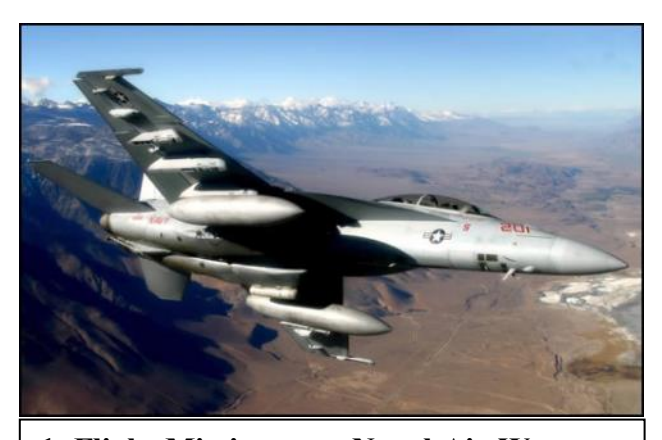
1. Flight Mission over Naval Air Weapons Station China Lake (NAWSCL). An impressive 85 percent of the Navy's research, development, acquisition, test, and evaluation programs are conducted at NAWSCL.

The installation was established as the Naval Ordnance Test Station (NOTS) on November 8, 1943 as a partnership between the Navy and California Institute of Technology for the testing and evaluation of rockets and other aviation ordnance. This partnership and interaction between civilian scientists/engineers and experienced military personnel has made China Lake one of the preeminent RDAT&E institutions in the world.