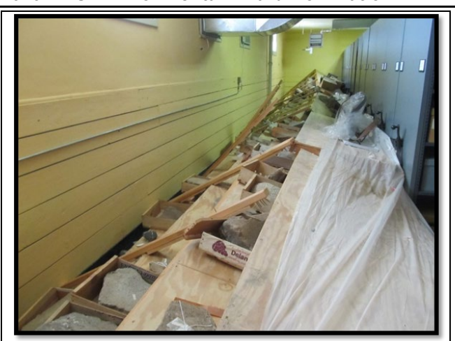
5. The photograph depicts another area in the Curation Facility at NAWSCL. It demonstrates the condition of the curation facility after the earthquakes of July 4th and 5th of 2019. This photograph was taken during the assessment phase of the earthquake recovery.

The attention of a full-time curator ensured the San Nicolas Island and NAWS China Lake archaeological collections met federal standards. The management of these vast combined collections co-located at NAWSCL has been approached with care. A significant enabler of archeological collection management is regular consultations with eight Federally-recognized Tribes and coordination with two state of California recognized tribes.