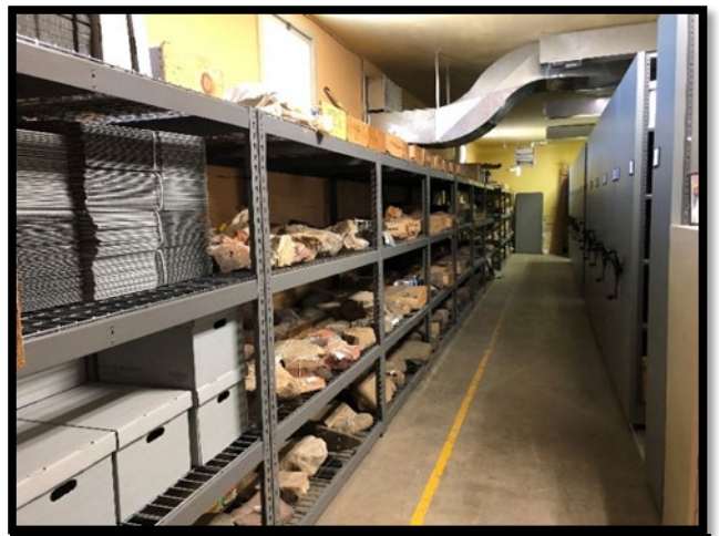
6. The photograph shows the steel reinforced replacement shelving at the NAWSCL Curation Facility. These shelving units keep artifacts stable and in place for curation.

The team used this as an opportunity to replace the wooden shelving with steel reinforced shelving lag bolted to the walls. This shelving is much more suitable to hold and maintain the curation facility artifacts. They also reorganized the collections and the topographic map cabinet which had fallen over, bringing things back to a state of order that facilitated further analysis and processing.