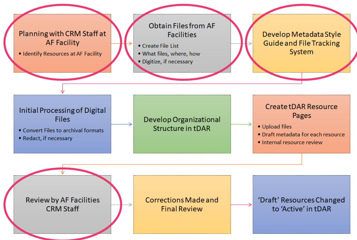
Figure 2. Generalized Diagram of the AF Digital Curation Procedures and Workflow for Legacy Data Projects

registered tDAR users. Once uploaded to the repository, the files are stored, backed-up securely and systematically, curated, and preserved for long-term discoverability, accessibility, and use. Participation in the archiving process by installation CRM staff is essential to ensure that projects are planned, appropriately conducted, and result in a tool that assists the base CRM staff in management, research, public outreach, and resource protection activities for which they are responsible. A general description of the procedure is presented in Figure 2 . The circled boxes indicate activities in which the installation CRM staff are most directly involved.