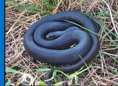
North American Racer ( Coluber constrictor )