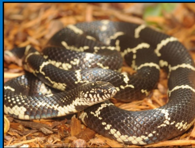
Eastern Kingsnake ( Lampropeltis getula )