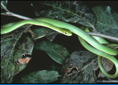
Rough Greensnake ( Opheodrys aestivus )