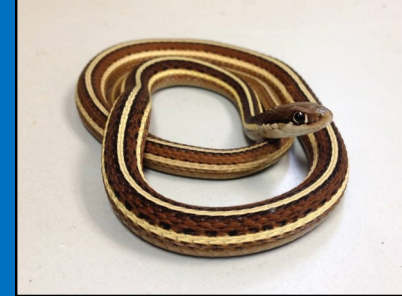
Eastern Ribbonsnake ( Thamnophis sauritus )