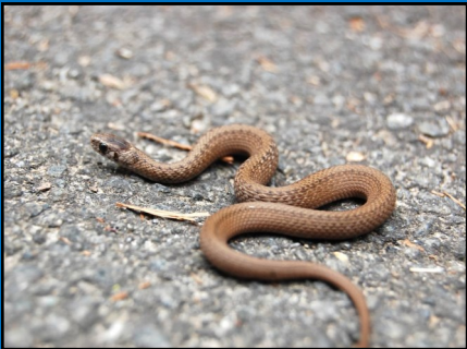
Northern Brownsnake ( Storeria dekayi dekayi )