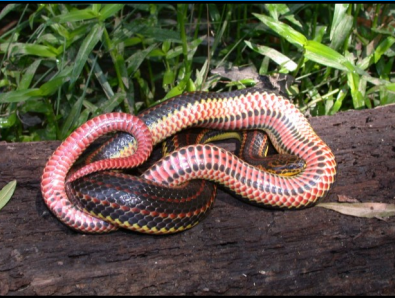
Rainbow Snake ( Farancia erytrogramma ) Potential