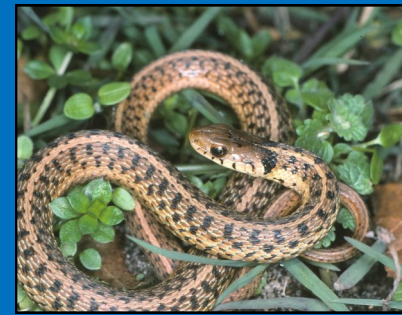
Eastern Gartersnake ( Thamnophis sirtalis sirtalis )