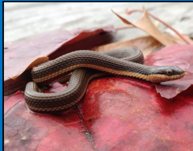
Queen Snake ( Regina septemvittata )