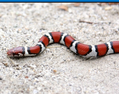
Coastal Plain Milksnake ( Lampropeltis triangulum elapsoides ) Potential