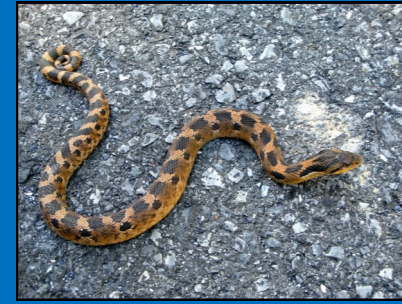
Eastern Hog-nose Snake ( Heterodon platirhinos )