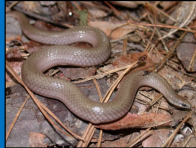
Eastern Smooth Earthsnake ( Virginia valeriae valeriae )