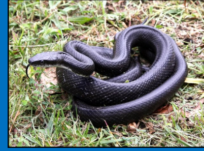
Eastern Ratsnake ( Pantherophis alleghaniensis )