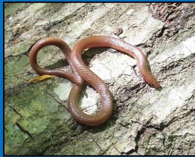
Eastern Wormsnake ( Carphophis amoenus amoenus )