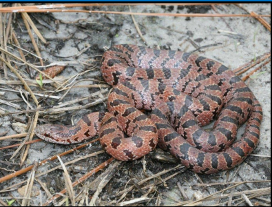
Mole Kingsnake ( Lampropeltis calligaster rhombomaculata ) Potential