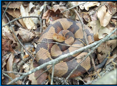
Copperhead ( Agkistrodon contortrix ) Venomous