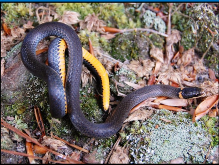
Ring-necked Snake ( Diadophis punctatus )

Fifteen species of snakes have been confirmed on Naval Support Facility Indian Head and there is the potential for three additional species to be present. The vast majority of snakes found on the installation, such as the Eastern Gartersnake, Eastern Ratsnake and Rough Greensnake are nonvenomous and harmless. The Copperhead is the only venomous snake found on the installation. Snakes play an important role in ecosystems of Maryland. Please do not kill snakes, particularly when they are encountered away from dwellings or work spaces.