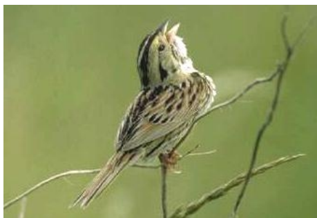
Henslow's Sparrow, a Watch List species, thrives on U.S. military installations.

Ultimately, by identifying high quality habitats and recognizing them as being important for birds, the IBA Program seeks to mobilize the resources needed to protect these areas by raising public awareness of their significance. With over 71 million Americans who watch and/or feed birds, the public is a powerful constituency for bird conservation. An important distinction should also be made that an IBA is not necessarily an important birding area. An IBA exists for birds, not for bird watchers. IBAs can include Watchable Wildlife opportunities, but only if such