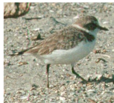
Western Snowy Plovers breed and winter on military lands in coastal California.

Any military installation or Army Corps of Engineers project is eligible to be nominated as an IBA if it potentially meets IBA criteria. Once a site is nominated, the appropriate organization reviews the nomination. If it meets the criteria, the site is identified as an IBA. Once a site has been identified, official recognition as an IBA via a ceremony or other public outreach method may take place at the discretion of the installation. A Memorandum of Understanding with American Bird Conservancy and National Audubon Society outlines the expected procedures to be followed for the IBA process on DoD lands. DoD sites recognized as IBAs may receive a certificate and sign.