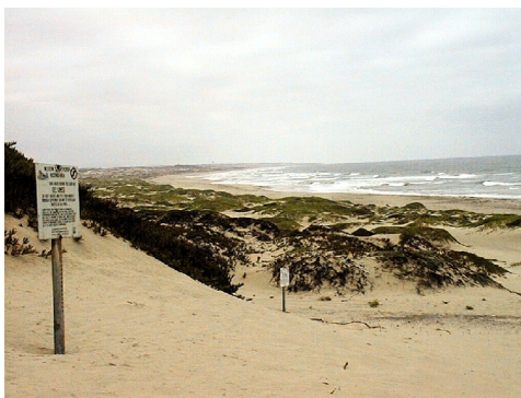
Vandenberg Air Force Base provides undisturbed beaches for nesting, wintering, and migrating shorebirds and waterbirds.

opportunities do not compromise the military mission or continued conservation actions. On military lands, IBAs can be an effective tool to engage adjoining landowners in landscape level conservation planning. Sometimes, it is the training mission itself that creates and sustains quality habitat. IBA recognition is thus an important tool to educate the public that while DoD lands are managed to support the military's training mission, they also provide significant habitat for the conservation of natural resources, including birds. When a conservation plan is desired for a network of IBAs, INRMPs and Corps comprehensive management plans already provide the necessary information; no additional management planning is required.