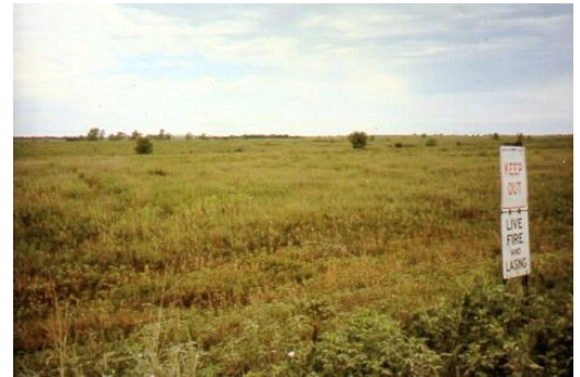
Fort Riley's (KS) 50,000 acres of native tallgrass prairie is the largest remaining contiguous habitat of this type in North America.

same year in partnership with ABC, and has been building programs state by state. As of 2004, Audubon was operating IBA programs in 46 states. Today, ABC continues its IBA program for sites of global significance, but Audubon is now the BirdLife partner designate in the U.S., and is expanding its IBA program to include sites of global and continental significance.