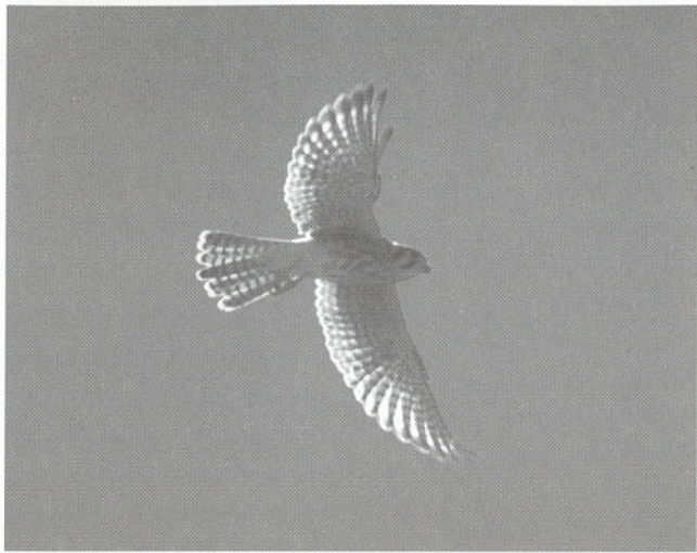
AMERICAN KESTREL