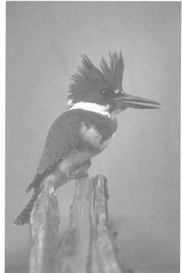
KINGFISHER