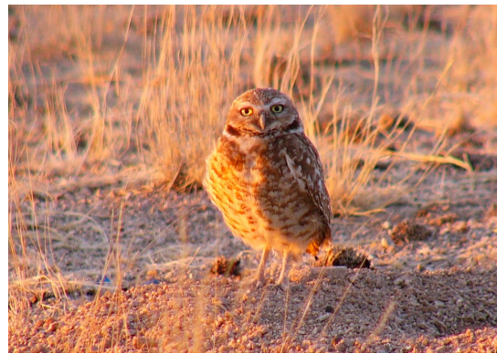
Adult Burrowing Owl on its breeding grounds at Kirtland Air Force Base, NM.

DoD manages approximately 28 million acres of land, water, and air resources across hundreds of installations; the Army Corps of Engineers manages an additional 12 million acres. These lands represent a critical network of habitats for birds, offering migratory stopover sites for resting and feeding, as well as suitable sites for nesting and rearing their young. The many installations that provide these important habitats form DoD's Steppingstones of Migration . DoD PIF is committed to ensuring that these areas, along with the species that depend on them, are protected and sustained for future generations.