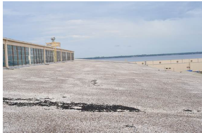
Figure 2. DoD PIF Steering Committee meets with NAS Jacksonville staff to provide guidance on Least Terns nesting on a Navy roof, April 15, 2015.