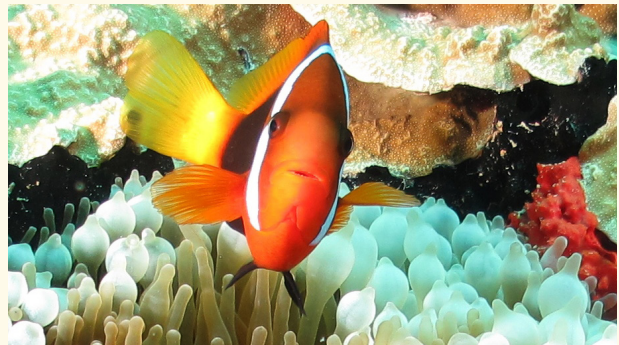
A tomato clownfish ( Amphiprion frenatus ) defends its territory in a bubble tip anemone ( Entacmaea quadricolor ) on a coral reef in Apra Harbor, Guam.

With 95% of the oceans still unexplored, there is much we do not yet know about this vast resource and all it contains. Nevertheless, we strive to learn and make use of that knowledge to inform our actions. Towards that end, I hope you will find this edition of Natural Selections enjoyable and informative.