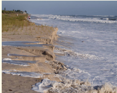
Wave action causes significant beach erosion along southern Onslow Beach near MCBCL.

Similarly, warming waters, sea level rise, more frequent and intense storms, acidification, and coastal erosion are becoming the new normal – and all play a role in stressing the plants and animals that live in these systems. And even though our love of coastal areas may mean that 70% of us end up living within 100 miles of a coast by 2070, all is not doom and gloom: marine systems still teem with life, beaches still welcome us, and natural resources managers the world over are hard at work to address these difficult problems.