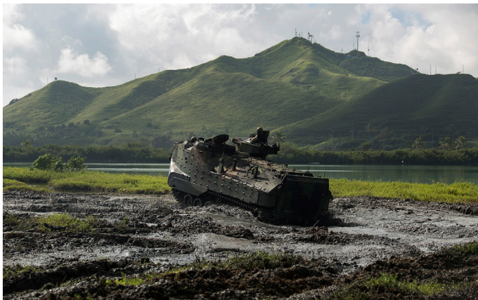
U.S. Marines team with the base environmental office each year to tear up the mud within the Nuupia Pond Wildlife Management Area and wetlands at Marine Corps Base Hawaii to help preserve the living conditions of wildlife in the areas.

This project identified DoD installations that provide optimal habitat for several wetland-dependent bird species to ensure that population declines do not curtail the military mission and reduce readiness, and to enable DoD to better manage wetland-dependent bird habitat. Researchers used field sampling data collected from 1999-2012 to develop habitat models that predict the distribution of 10 species of secretive marsh birds within DoD installations across the continental U.S. Researchers then used these models to rank important DoD installations for these species based on their wetland habitat. This work represents a vital first step towards identifying, predicting, and ultimately conserving the most valuable wetland habitats on DoD installations for a suite of wetland-dependent birds, and therefore a step toward proactive management of these species.