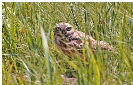
The burrowing owl only stands 9-11 inches tall and lives in underground burrows.

This project determined the migratory habits and wintering grounds of the burrowing owl, an endangered species found on several western DoD installations. The project team worked with over 20 partners in the