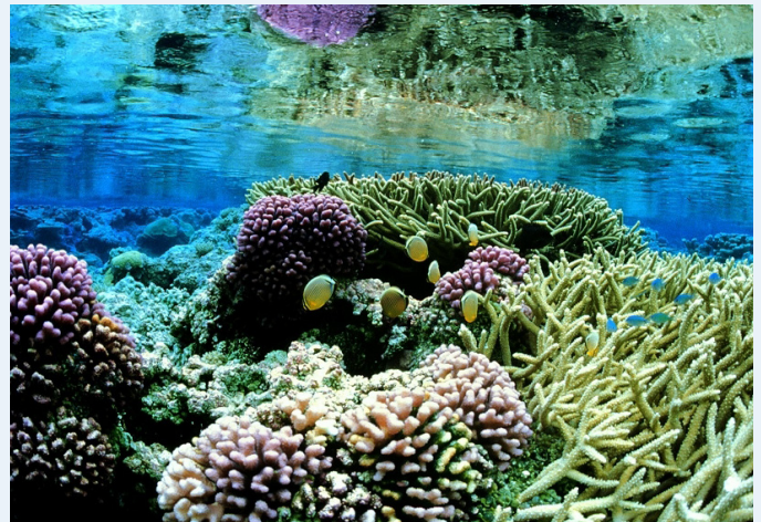
The pink coral gardens of Palmyra Atoll in the Pacific Ocean abound with tropical fish.

DoD Instruction 4715.03, Natural Resources Conservation Program , directs DoD to inventory biologically or geographically significant or sensitive natural resources on its properties. Information for these inventories is necessary to prepare INRMPs which are required by the Sikes Act. Establishing baseline data is the foundation of any assessment program, and will support the mapping and inventory initiative of all U.S. coral reef ecosystems. The Legacy Resource Management Program funded DoD Coral Reef Initiative Database , which helps identify sensitive coral reef species and their critical habitats, and provides the latest information on threats and assessment techniques. It helps define which laws pertain directly to the reefs under DoD stewardship and how DoD responsibilities overlap with