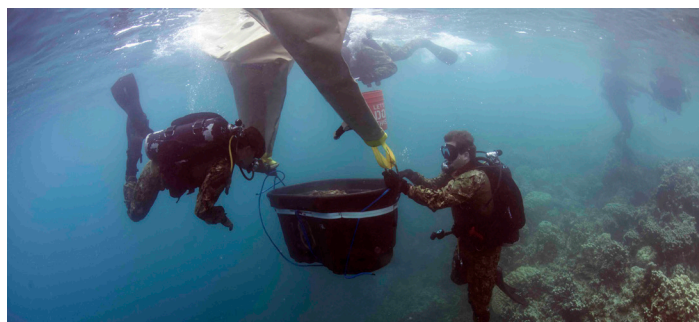
Explosive ordnance disposal technicians assigned to EODMU-5 help repair a damaged coral reef in Apra Harbor.