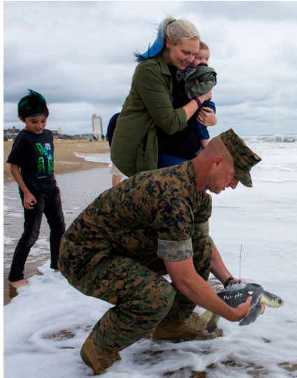
After a recreational angler hooked this turtle, "Purple Heart," researchers outfitted it with a satellite tag and a PIT tag in its front flipper. A two-time Purple Heart recipient and his family released the turtle in June 2017.

The Lower Chesapeake Bay and nearshore areas surrounding the mouth of the bay represent one of the busiest hubs of naval activity on the East coast and host many pierside facilities, bases, vessels, shipyards, and in-water training areas. Sea turtles in the area are all listed as threatened or endangered, and can be impacted by human activities including recreational fishing, boat traffic, dredging, pile driving, and other activities that create noise and affect the underwater landscape. Understanding the location and behavior of sea turtles near these activities is vital to limiting potentially harmful interactions. Currently, our understanding of sea turtle movement and habitat use in the Chesapeake Bay and coastal Virginia waters is limited. Further data collection is needed to ensure compliance with applicable environmental laws.