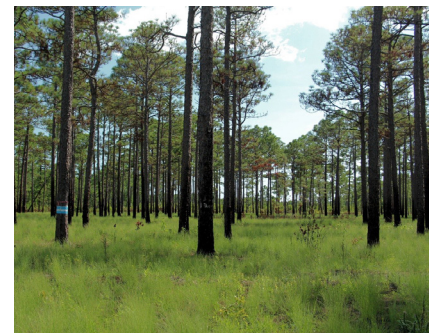
Longleaf pine forests of MCBCL provide habitat for endangered species like the red cockaded woodpecker, training land for the military, and carbon storage.

Terrestrial: DCERP findings show that restoring longleaf pine habitat will not only benefit the endangered red-cockaded woodpecker ( Picooides borealis ), but a host of other avian species whose population densities increased when longleaf pine habitat was restored. Restoration efforts also support the overall wildlife community and plant diversity of the forest. Longleaf pine ( Pinus palustris ) savannas and flatwoods once dominated upland terrestrial ecosystems across the southeastern U.S., including MCBCL.