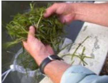
Sampling SAV populations provides critical information for installation natural resource managers.

Submerged aquatic vegetation (SAV) is one of the most critical habitats found in coastal regions throughout the world, including the Chesapeake Bay and its tributaries. Underwater grasses provide essential habitat and food for a variety of fish and invertebrate species, including the blue crab and migratory waterfowl. In addition, grass beds contribute to the overall health of the Chesapeake Bay by absorbing nutrients, adding oxygen to the water, and protecting the coast by filtering sediment and dissipating waves. For all these reasons, many DoD installations in the Chesapeake region have a keen interest in managing this habitat under their jurisdiction. Installations along the Chesapeake Bay shoreline are actively losing land because of erosion, threatening shallow water SAV beds that protect shorelines and support mission readiness by preserving land and protecting the realistic environments that testing and training require.