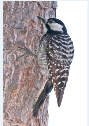
Red-cockaded woodpecker.

Through case studies, course participants learn strategies for facilitating regulator and stakeholder cooperation while protecting natural resources in ways that ensure no net loss in mission capability. Specific case studies include red-cockaded woodpecker management on Army lands, a USFWS consultation for U.S. Marine Corps build-up on Guam and the Mariana Islands, and Air Force coordination with a USFWS liaison to manage forest structure and expand red-cockaded woodpecker colonies.