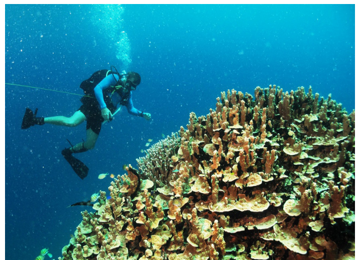
An active duty Navy diver supports measurement of a large coral colony (Porities rus) located in Apra Harbor, Guam during a natural resources survey in August 2017.

In July of 2017, the Naval Base Guam (NBG) Environmental Office coordinated with Andersen AFB, to assess aquatic natural resources for Joint Region Marianas. Combined military-civilian dive teams completed over 20 hours of dive surveys in Apra