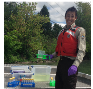
An aquatic invasive species crew member takes environmental DNA samples out in the field. Environmental DNA uses genetics to look for invasive species in water samples.

DoD lands include six threatened or endangered amphibian species and 23 threatened or endangered fish species, creating potential constraints on training and resource management. These species pose unique challenges for inventory and monitoring due to the difficulty of thoroughly surveying aquatic environments. An efficient alternative to traditional field surveys is the use of eDNA to detect species presence. The project team developed and validated eDNA sampling protocols for a variety of aquatic species, including frogs, salamanders, fish, and disease-causing pathogens. Techniques used during this demonstration are helping inform ongoing natural resource management activities, including development of species-specific endangered species management plans, ESA consultations with USFWS, and early detection and control of invasive aquatic species that may prey on or hybridize with native species.