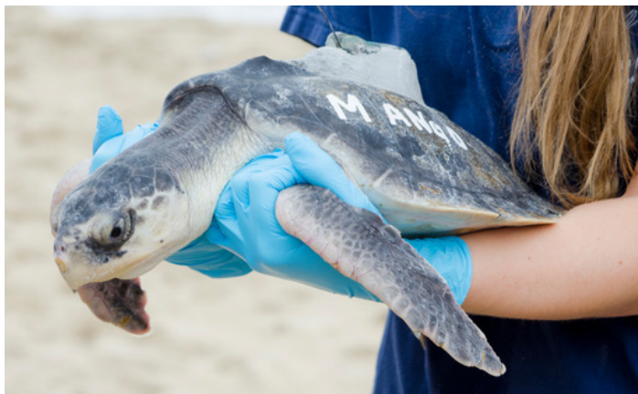
DoD researchers fitted this turtle, "Mango Tango," with a small satellite tag. It can now be tracked on seaturtle.org .

The Virginia Aquarium & Marine Science Foundation (VAQF) is working with NAVFAC Atlantic and U.S. Fleet Forces Command (USFF) to track young loggerhead, Kemp's ridley, and green sea turtles, using a combination of satellite and acoustic transmitters. To date, this USFF-funded effort has fitted 43 satellite transmitters and 72 Vemco™ acoustic tags on sea turtles in Virginia waters. The satellite tags transmit locations to a satellite that returns thousands of locations. The acoustic tags emit a signal that is recorded by a receiver as the sea turtle swims past it.