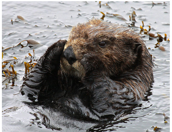
A southern sea otter settles down to rest in a small patch of feather boa kelp (Egregia).

Thirty years ago, the Navy joined forces with USFWS to help recover California's southern sea otter ( Enhydra lutris ). Decades of collaboration and shared research have resulted in a better overall understanding of the positive effects sea otters have on the nearshore marine ecosystem without compromising the Navy's ability to conduct essential national defense activities in southern California.