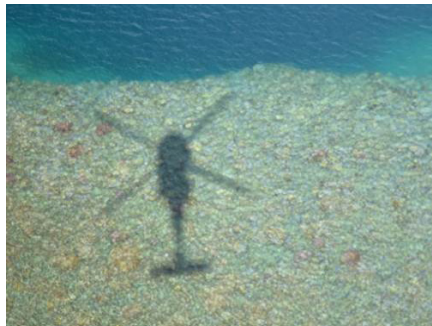
Aerial photo taken over a shallow reef flat in Apra Harbor, Guam, from a Navy MH-60S helicopter assigned to HSC-25 'Island Knights' in August 2017.

EODMU5 provided a platoon of divers to determine the condition of corals at Western Shoals, while other divers completed unmanned underwater vehicle operations, which were essential to getting images of areas within the Inner Apra Harbor where water visibility was too low for a traditional visual survey. In addition to the underwater surveys, MH-60S Seahawk helicopters from HSC-25 "Island Knights" completed the first rapid aerial coral bleaching photographic survey of the reefs where the depth of water was too shallow for diving.