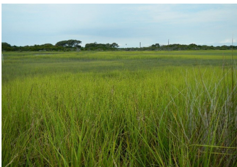
Black needlerush (Juncus roemerianus) is the predominant marsh plant in the estuary that prefers brackish water conditions (left), while smooth cordgrass (Spartina alterniflora) prefers more saline waters along the Intracoastal Waterway (right).

nutrients to improve estuarine water quality, serve as nursery areas for marine species, and protect installation infrastructure from erosion and storm surge. The loss of coastal wetlands from sea-level rise would put critical installation infrastructure and training grounds at-risk of flooding.