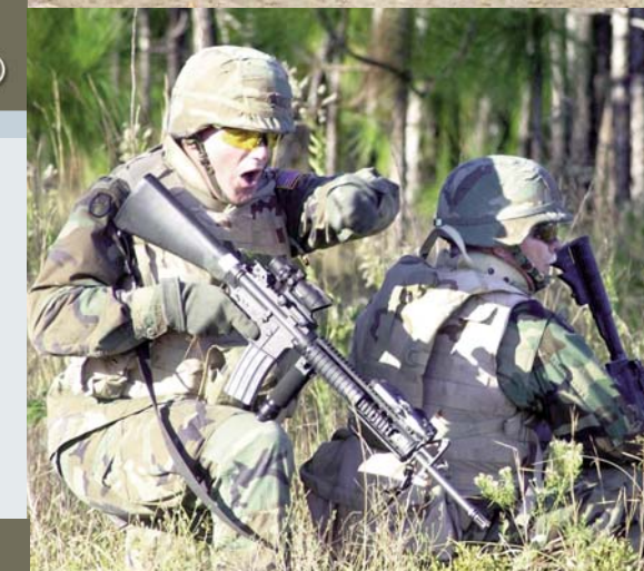
Crossing the Saddam Canal, Iraq