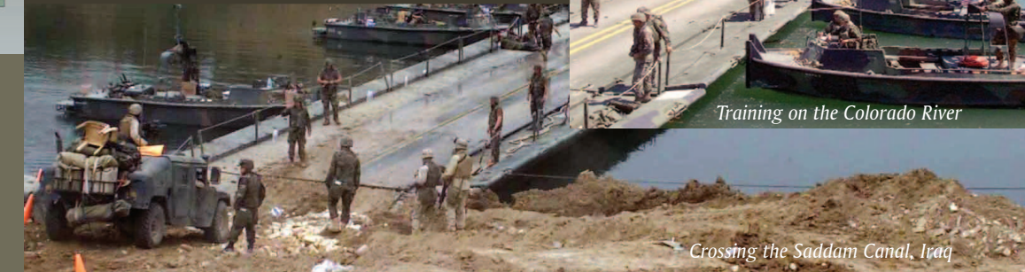
Crossing the Saddam Canal, Iraq