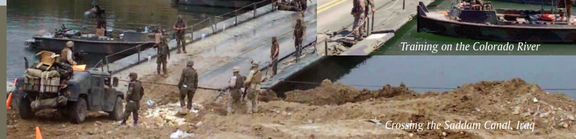
Crossing the Saddam Canal, Iraq