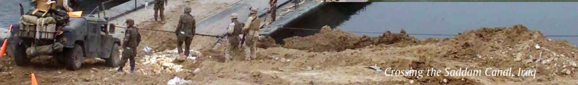
Crossing the Saddam Canal, Iraq