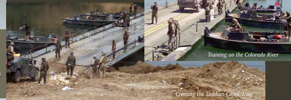
Training on the Colorado River

Our troops need to train in settings similar to the real combat environments they will find themselves in. This ensures that when called upon, their fighting skills are second nature.