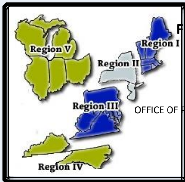
NAVFAC MIDLANT DoD REC Map

To find out more about the Regional Environmental Coordination (REC) Office and browse back issues of the REC Review visit http://denix.osd.mil/rec/home/ . To receive a copy of this electronic publication, send a subscription request to angela.s.jones7.civ@us.navy.mil .