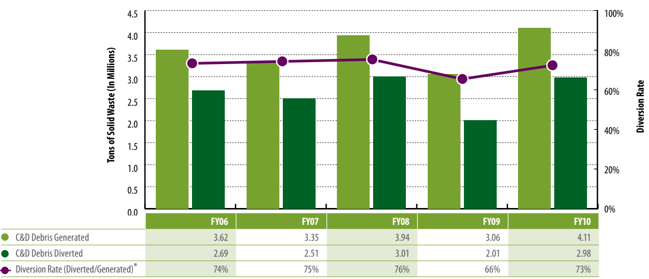
Figure 5-2 DoD C&D Debris Solid Waste Progress (Millions of Tons) (U.S. and Territories & Overseas)

*Diversion rates are calculated from exact numbers.