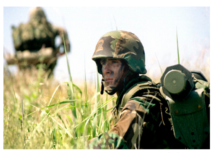
Marines from the 31st Marine Expeditionary Unit wait to be flown out by Marine Corps CH-46 Sea Knight helicopters after completing a "Training in Urban Environment" exercise in Dededo, Guam.

Since 1945, the average time between commitments of U.S. Armed Forces to combat has been four years; but that time has decreased. As a result, U.S. Armed Forces no longer have the advantage of long periods for testing and training after a conflict starts. They must be ready to respond immediately when called.