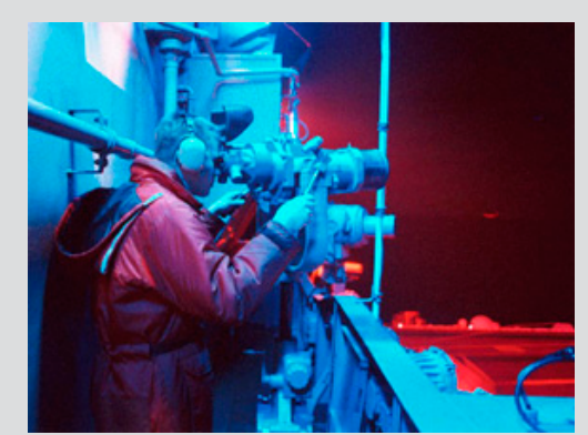
A Seaman stands watch aboard USS George Washington as the forward night lookout, watching for any objects in the path of the ship, including the Northern Right Whale.

The Navy also partially funds state fish and wildlife agencies' efforts to use light aircraft to patrol the Northern Right Whales' migration route to spot and report whale sightings. In March 2001, the Marine Mammal Commission thanked the Navy for its continuing attention to protecting Northern Right Whales. The Commission commented that the Navy's efforts were a noteworthy example of its attention to critical environmental protection needs.