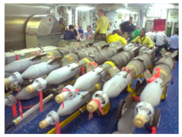
Sailors aboard the USS Enterprise (CVN 65) take a break from the business of the day for meals and relaxation. However, never far away are reminders of the serious mission that every member of the crew supports: Operation Enduring Freedom. Bombs stand ready on the mess decks, prior to their transfer to the flight deck above, for missions over Afghanistan as part of that operation.

The issue of unexploded ordnance (UXO) and ordnance debris or constituents has received tremendous attention within DoD and from Congress and the public over the past several years. Although impact areas (the actual target areas where ordnance falls) constitute a very small portion of military training space, and most training ordnance is inert (non-explosive), over time these areas accumulate UXO, UXO constituents (UXO(C)), and target debris. Impact areas and the surrounding safety fans provide well-protected habitat for endangered species since grazing animals and predators, including humans, are fenced out. Safety fans are the safety buffer zones around impact areas; 99 percent of munitions fall within the impact areas, not in the safety fans.