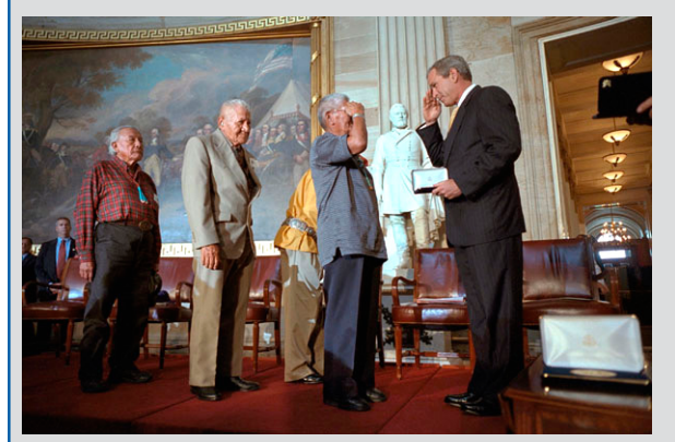
President George W. Bush honors Native Americans who fought in World War II.

It is a little-known fact that American Indians and Alaska Natives have the highest per capita participation in the military. There are nearly 190,000 Indian veterans—one out of every four Indian males is a military veteran and over 45 percent of present-day tribal leaders are military veterans. In addition, 24 Indian veterans have