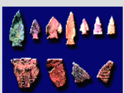
The historic Fort Benning agreement spells out how American Indian cultural artifacts, such as these ancient arrowheads, and human remains discovered on the land will be handled.

On December 13, 2000, a historic land exchange agreement was signed by the City of Columbus, Georgia; Fort Benning, Georgia; and five American Indian nations (the Alabama Coushatta Tribe of Texas, the Chicasaw Nation, the Muscogee Creek Nation, the Poarch Band of Creek Indians, and the Seminole Tribe of Florida). The agreement marked an 11-year planning effort among the parties to protect tribal cultural resources and to create greater economic development opportunities for the City of Columbus.