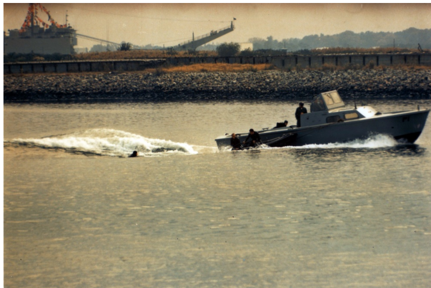
Figure 51. On Chesapeake Bay, a large personnel landing craft of Coastal River Squadron 2 tows an inflatable boat on the way to picking up a SEAL team member during riverine training, December 1973 (NARA RG 428-GX Box 668-K101422).