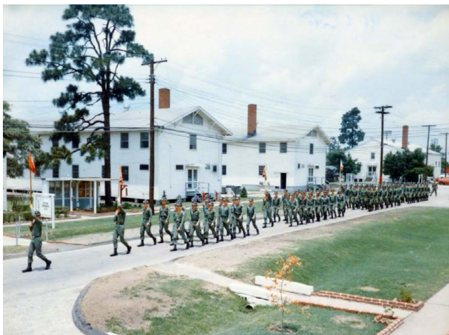
Figure 32. Training activities at Fort Gordon, Georgia, showing reused WWII temporary buildings in the background, June 1966 (NARA 111-CCS).

The reuse of WWII barracks was common throughout the Army, even as barracks modernization campaigns were underway (Figure 32). These new barracks complexes usually included a brigade headquarters building, a battalion headquarters building, company administration buildings, barracks, classrooms, mess halls, a chapel, a branch PX, a branch medical clinic, and a gymnasium (Figure 33).