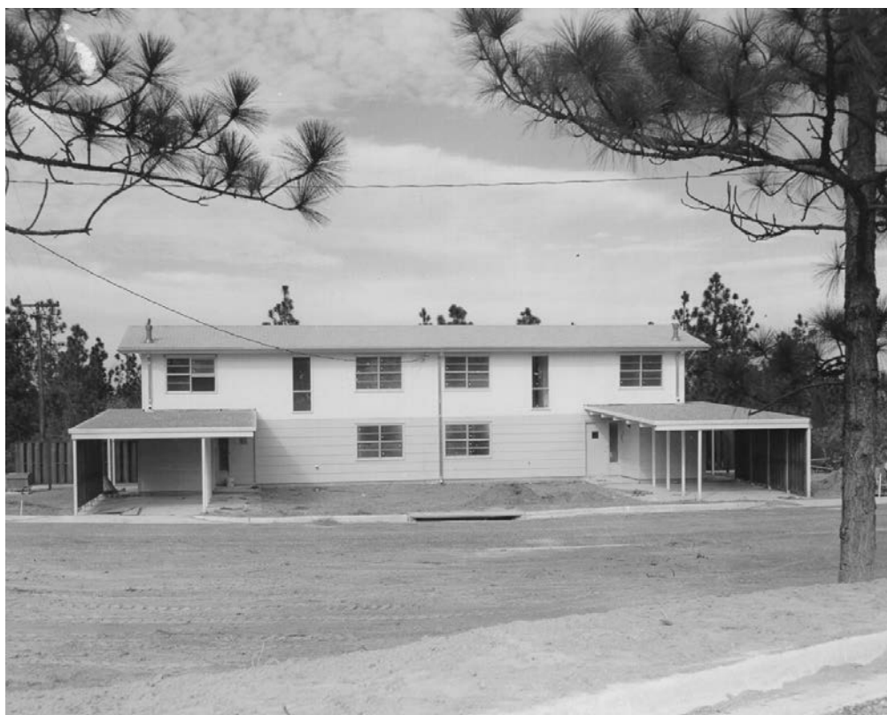
Figure 39. New Officers' Quarters at Fort Gordon, 1966 (Office of the Signal Corps Historian).

figured importantly as a career incentive. Ultimately, the Army hoped to provide adequate permanent housing for all military personnel at permanent installations (Figure 39). The housing deficit in 1965 still exceeded 13,000 officer spaces. 201 By 1971, family housing quarters were being leased from the private sector at Fort Carson on an experimental basis, and additional resources were being sought to overcome a backlog in deferred family housing maintenance. 202 New administrative facilities for managing installation family housing were also constructed.