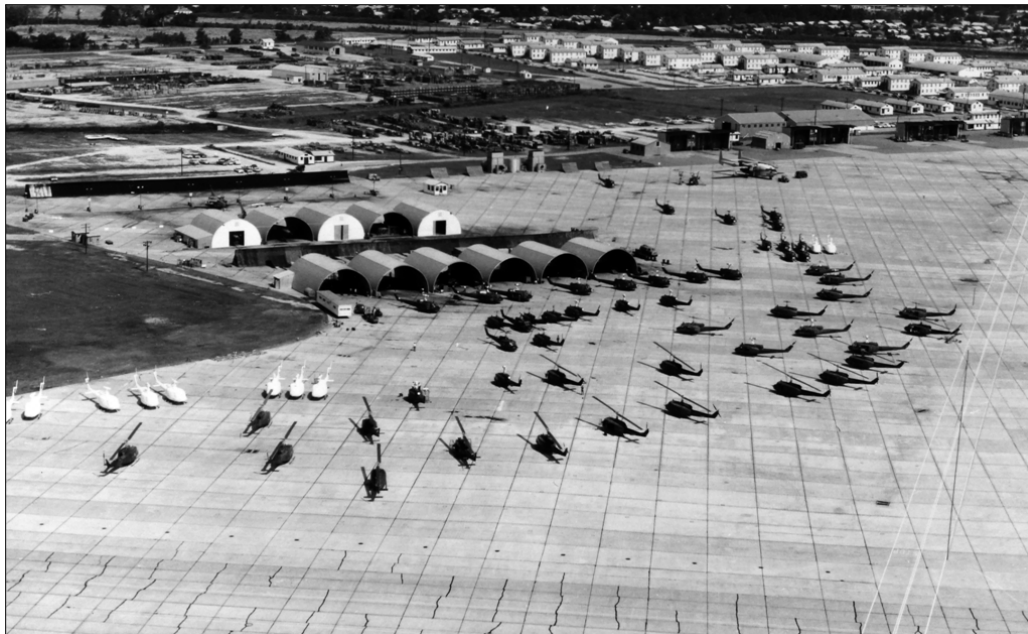
Figure 15. The First Cavalry (Airmobile) Division's helicopters sit on the ramp at Air Force Logistics Command's Mobile Air Material [sic] Area at Brookley AFB, Alabama. The helicopters have been sea-sprayed in the hangars in preparation for being loaded on ships headed for Vietnam, November 1965.