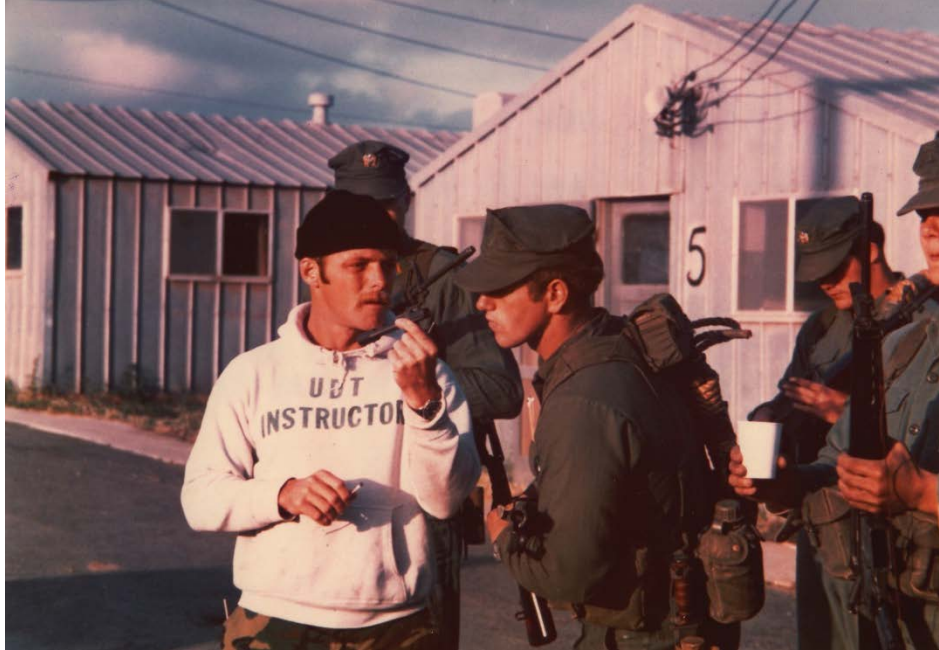
Figure 50. An instructor explains the method of firing the M-16 rifle to students of the basic underwater demolition SEAL training class at Naval Air Base Coronado, California [note prefabricated metal buildings in the background], March 1975.