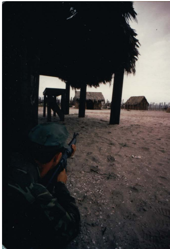
Figure 48. Thatched structures were part of Dragon Village, a Navy mock-up Vietnamese settlement used in SEAL team training exercises at Coronado, California, February 1968.

Like other military services, the Navy constructed a mock Vietnamese village for troop training. In the Navy, the mock village was used for advanced SEAL training rather than as a complement to infantry training as in the Army. Figure 48 and Figure 49 illustrate the Navy's mock village. Located on Naval Air Base Coronado, the mock village lacked the vegetated setting that the mock villages at Fort Polk featured. Nevertheless, the Navy's mock village featured permanent and semi-permanent structures made of concrete blocks or thatched grass.