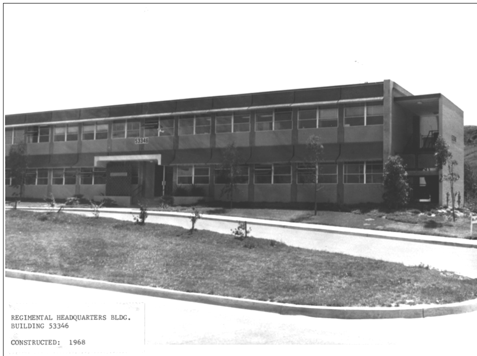
Figure 61. Regimental Headquarters-1 st Marines at Camp Pendleton, California, constructed in 1968.

In the late 1960s, plans were approved at Camp Pendleton for a 64,000 square-foot, pre-cast concrete base headquarters building (Building 1160). Eventually costing $1.2 million, the building was located on Vandegrift Boulevard. 363 Other headquarters constructed at Camp Pendleton were the Regimental Headquarters (Figure 61).