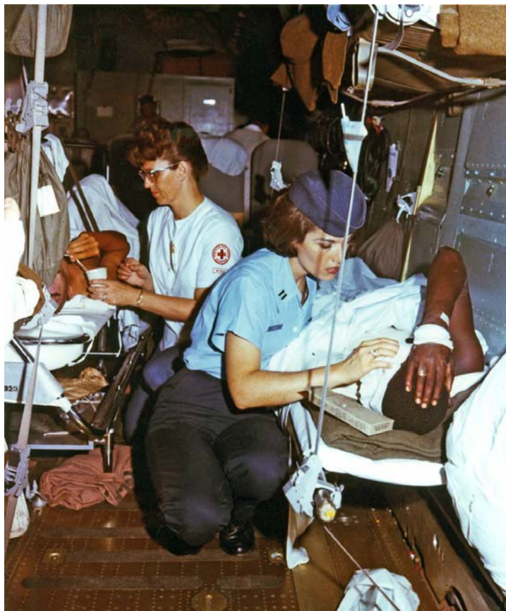
Figure 68. An Air Force nurse and a Red Cross nurse attend to patients aboard an Air Force C-141 for an evacuation flight from Vietnam to the U.S., 1967 (USAF photo).

Throughout the war, many of these patients were either treated or transited through Travis AFB. During the Vietnam War, Travis assumed responsibility as the West Coast terminus for MAC aeromedical transports. In fact, throughout the Vietnam War, wounded troops were most often transported to Travis AFB. The spring of 1968 recorded increasing arrivals of wounded (sometimes over 5,000 per month), at Travis, with the David Grant USAF Hospital receiving an average of 4,070 patients a month throughout 1968. 425 At the height of this effort, over 9,000 patients (all injured during the February 1969 TET Offensive) were