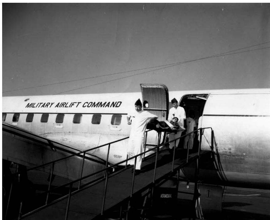
Figure 67. MAC returns a former POW of the Viet Cong to Fort Campbell, Kentucky, November 1969.

Air Force Nurse Corps personnel arrived in South Vietnam in early 1966 and were assigned to the 12 th U.S. Air Force Hospital in Cam Ranh Bay. Later arrivals saw duty serving within South Vietnam in aeromedical evacuation squadrons and in dispensaries throughout the area. Additionally, Air Force nurses served on the evacuation flights from South