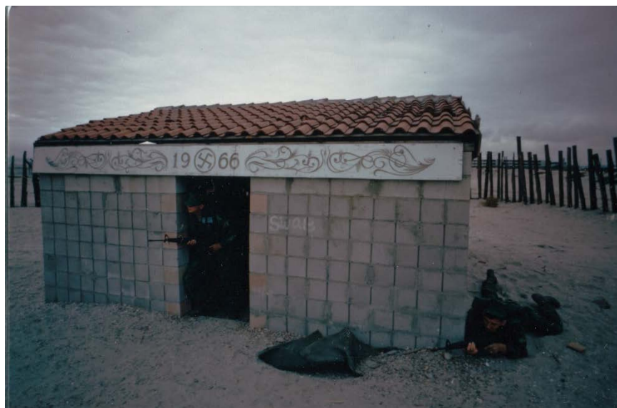
Figure 49. Concrete block structures were also part of Dragon Village. A Navy mock-up Vietnamese settlement used in SEAL team training exercises at Coronado, California, February 1968 (NARA RG 428-GX Box 668-45263).