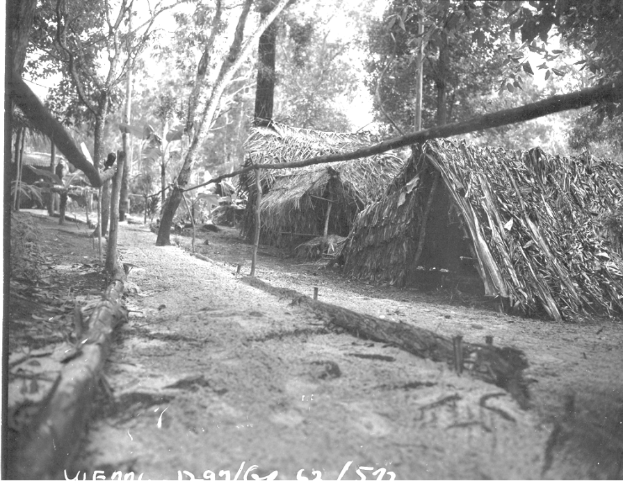
Figure 22. Station 3, Field craft and shelters at the Jungle and Guerrilla Warfare Training Center, Schofield Barracks, Hawaii, showing types of shelters, May 1962 (NARA SC598166).