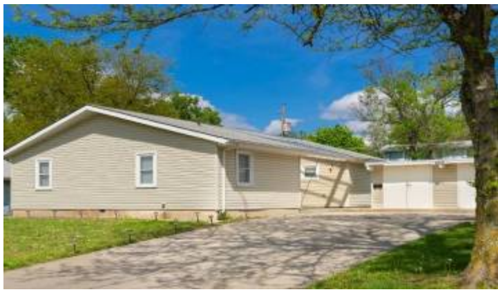
Fort Riley KS - Constructed 1963

This section includes photographic examples of Army Vietnam War Era housing from installations across the country. The housing photographs are ordered chronologically, with the specific installation and date of construction identified. The photographs were selected to show the range of single family, duplex, multiplex, and townhouses constructed during the Vietnam War Era. The standardized designs in the 1964 DoD Design Folio, and detailed descriptions of Vietnam War Era housing from several Army installations may be found on the Army Vietnam War Era housing website <a href="https://www.denix.osd.mil/Army-vwehh-pc">https://www.denix.osd.mil/Army-vwehh-pc</a>.