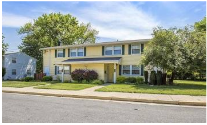
Fort Detrick, MD – Constructed 1965