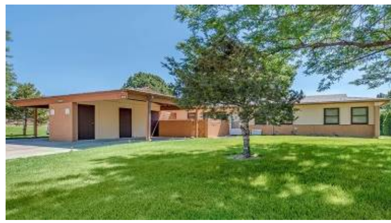
Fort Carson, CO – Constructed 1970