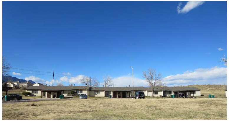
Fort Carson, CO – Constructed 1971