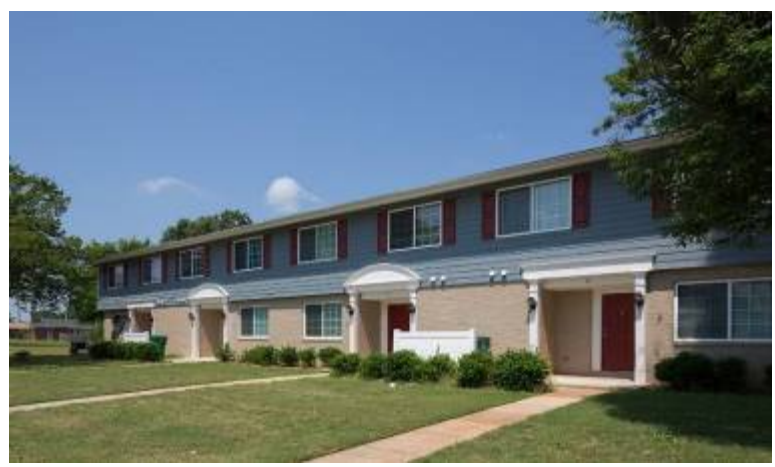
Fort Benning, GA – Constructed 1969