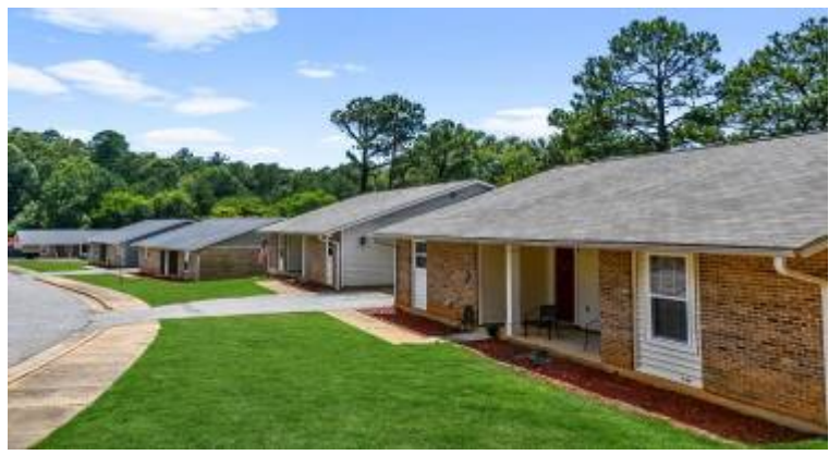
Fort Benning, GA - Constructed 1975