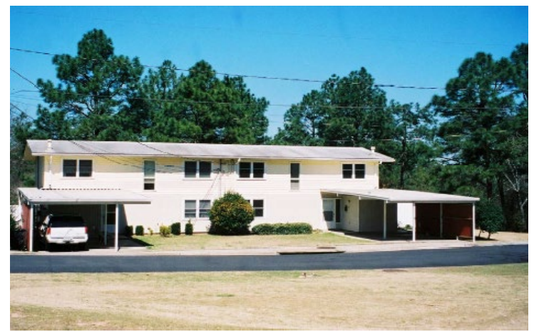
Fort Gordon, GA – Constructed 1966