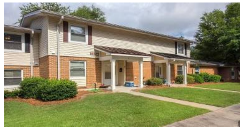
Fort Jackson, SC – Constructed 1972