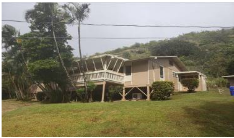
Fort Shafter, HI – Constructed 1973