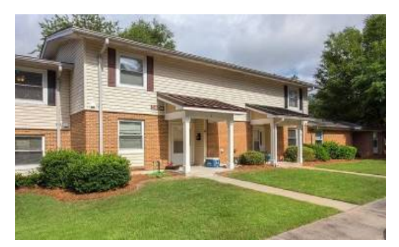
Fort Jackson, SC – 1972