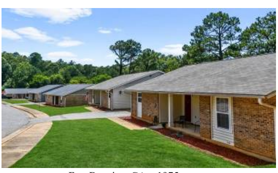
Fort Benning, GA – 1975