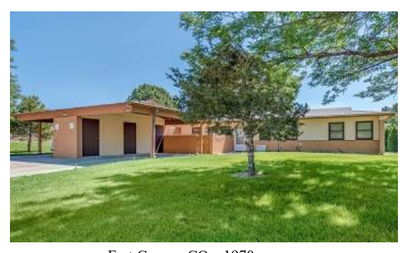
Fort Carson, CO - 1970