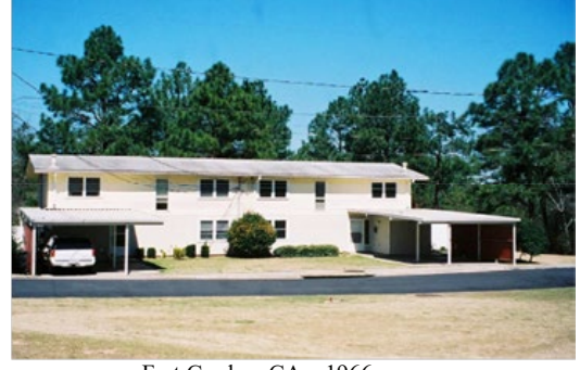
Fort Gordon, GA – 1966