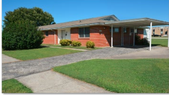
Fort Campbell, TN - 1963