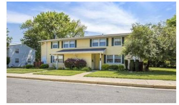
Fort Detrick, MD - 1965