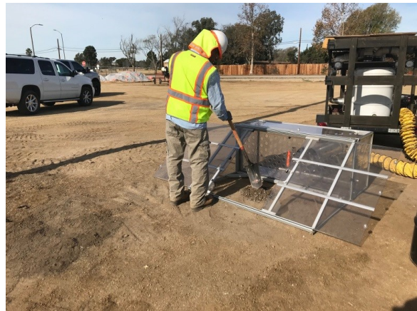
The NBVC Environmental Restoration Program developed an innovative mobile chemical agent containment hood at the former Gas Mask Training Area to remediate chemical agent identification sets containing phosgene, chloropicrin, mustard gas, and lewisite. Using this negative pressure device protects residents in nearby military family housing and workers at the site.