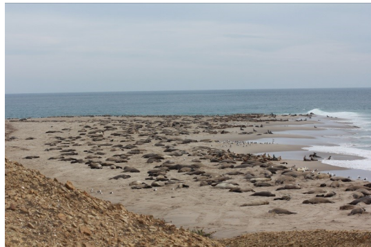
Marine mammal breeding colonies dominate the coastlines of Naval Base Ventura County's (NBVC) San Nicolas and San Miguel Islands. More than 250,000 California sea lions and northern elephant seals populate these shores to breed, the densest marine mammal colony in North America. The NBVC Environmental Restoration Program is committed to protecting this habitat.