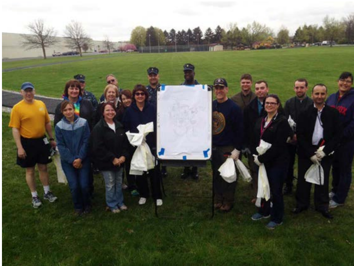
Volunteers help clean up a BMP at NSA Mechanicsburg.

Aside from Earth Day events, the EV staff at NSA Mechanicsburg conduct annual stormwater and EV awareness training to tenants on the installation. Locally-created educational BMP signage and photo collages of stormwater bioretention facilities inform the public that NSA Mechanicsburg cares and remains committed to protecting and improving the Chesapeake Bay. Though 2020’s Earth Day was put on hold, NSA Mechanicsburg’s tenants, staff, and community have a strong foundation of over 20 years of great educational content to sustain them until Earth Day events resume in 2021.