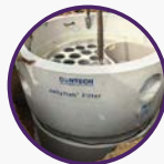
Stormwater Treatment Manufactured/Constructed (Manufactured treatment devices (MTDs))