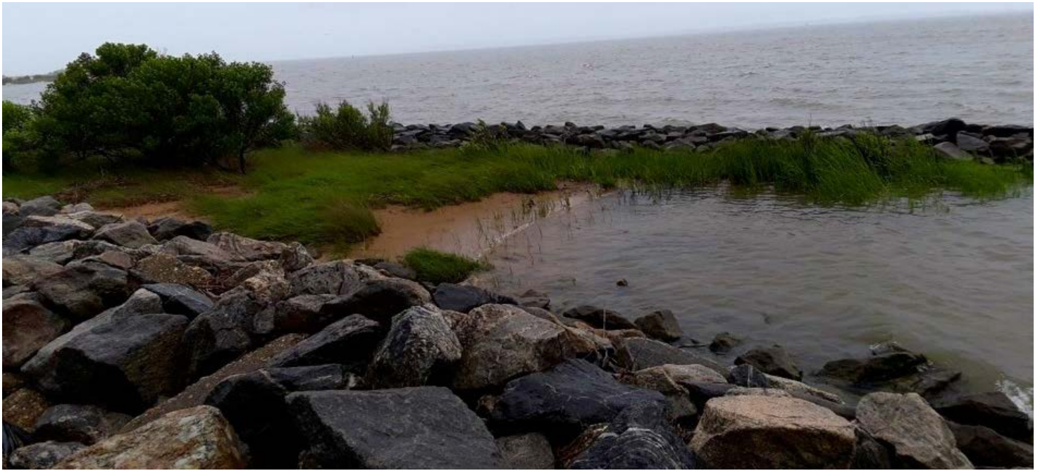
JBLE-Eustis Western Shoreline Project after the restoration.