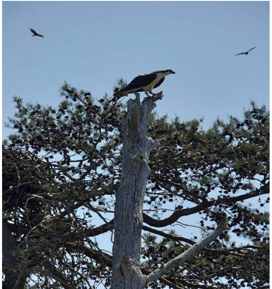
Osprey roosting at JBLE-Eustis

Air Force civil engineers strive to support the mission, while promoting good environmental stewardship and honoring the Chesapeake Bay Watershed agreement. The JBLE EV staff advocate for funding to achieve the goals and objectives outlined in their respective INRMPs. The plans target benchmarks to reduce shoreline erosion, improve stormwater quality, and complete urban forest surveys for preservation of wildlife habitats. The projects described below, which were funded with Air Force dollars, are examples of how JBLE is achieving these objectives.