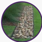
Stormwater Filtration (permeable pavement, infiltration trench)