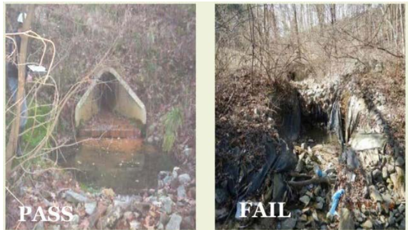
Figure 1. Example of outfalls passing and failing visual inspection

The first step of the Pond Protocol is to conduct an initial field investigation to flag dam safety concerns or water quality issues. Identified issues can range in severity from preventative maintenance needs to outright pond failures resulting in complete loss of function.