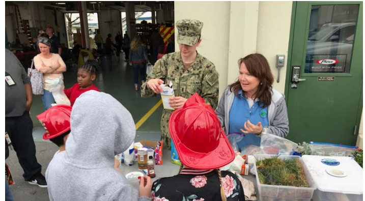
Children attending Bring Your Child to Work Day can build their own mini-bioretenion system.

Another popular hands-on exercise allows visitors to build mini-bioretenion systems with real grass and plants, engineered soils, and underdrains. These mini-bioretenion areas are then “polluted” with dirty water to demonstrate how the natural systems in the bioretention system, the plants and soil, filter contaminants. The polluted water looks much cleaner after being filtered through the bioretention. Activities are also conducted to promote plant and wildlife diversity; children are invited to plant milkweed seeds to attract monarch butterflies in the installation’s existing bioretention facilities.