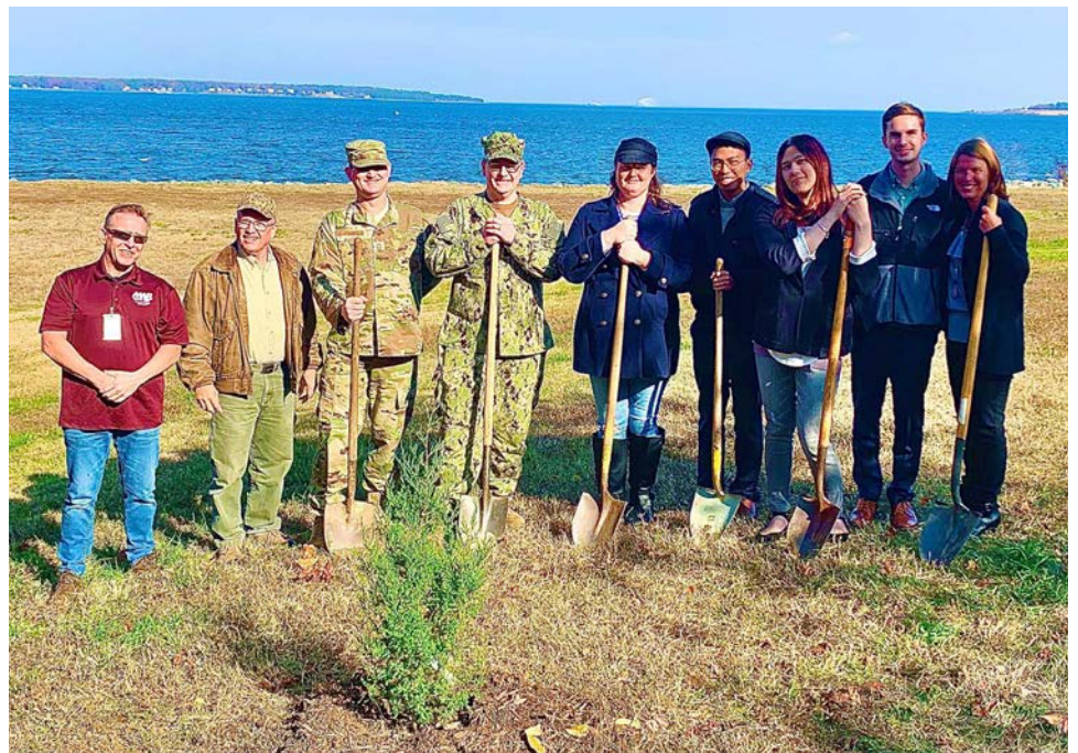
Volunteers from NAS Patuxent River participate in a tree planting event in 2019.