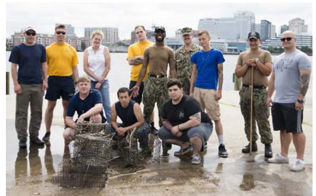
Volunteers at NSA HR perform oyster gardening.

Stephanie MacDurmon, Brown and Caldwell, reviewed the trends in the types of water quality BMPs installed at DoD installations, as reported in the 2019 datacall. Since 2010, DoD installations have implemented more practices that rely on infiltration, which efficiently reduce pollutant loads. However, a large of number of acres are treated by wet and dry ponds, which remove pollutants at a lower rate. This presents opportunities to retrofit less efficient practices to achieve additional pollutant removal. She highlighted types of retrofit opportunities such as new BMP retrofits, existing BMP retrofits, and BMP restoration retrofits. Other innovative options could include impervious surface disconnection, conservation landscaping, smart ponds, and MTDs.