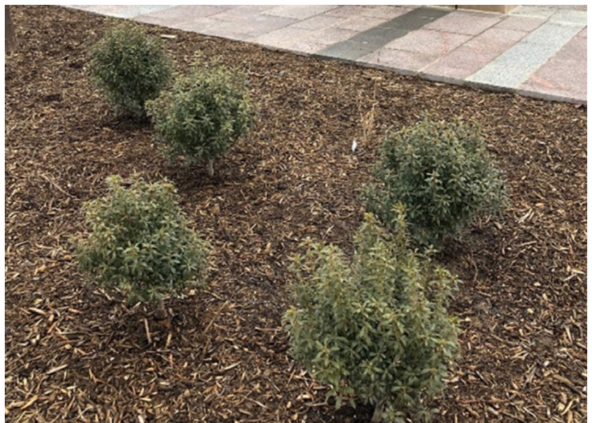
Figure 2: In the final design, Ilex glabra provides winter interest with its evergreen leaves.