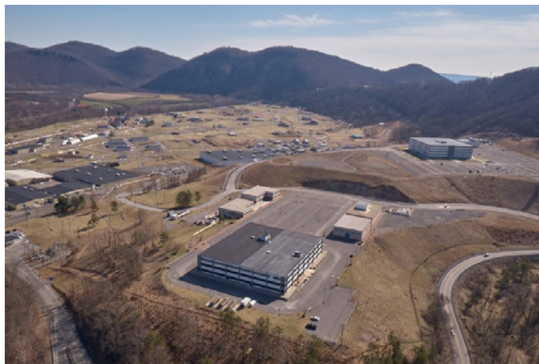
Aerial image of ABL in West Virginia.

Remediation of several sites at ABL is required by law under the Comprehensive Environmental Response, Compensation, and Liability Act (CERCLA). Soil and groundwater clean-up efforts will improve the quality of local soil, groundwater, and surface waters and contribute to the removal of toxic contaminants in the Chesapeake Bay watershed, which is one of the stated objectives in the Chesapeake Bay Watershed Agreement. The ABL Environmental Partnering Team tasked with these efforts consists of Remedial Project Managers representing the Navy, EPA, and the WV Department of Environmental Protection, as well as consultants contracted by the Navy. This article describes remedial activities and green initiatives at Site 1, also known as the Northern Riverside Waste Disposal Area, at ABL.