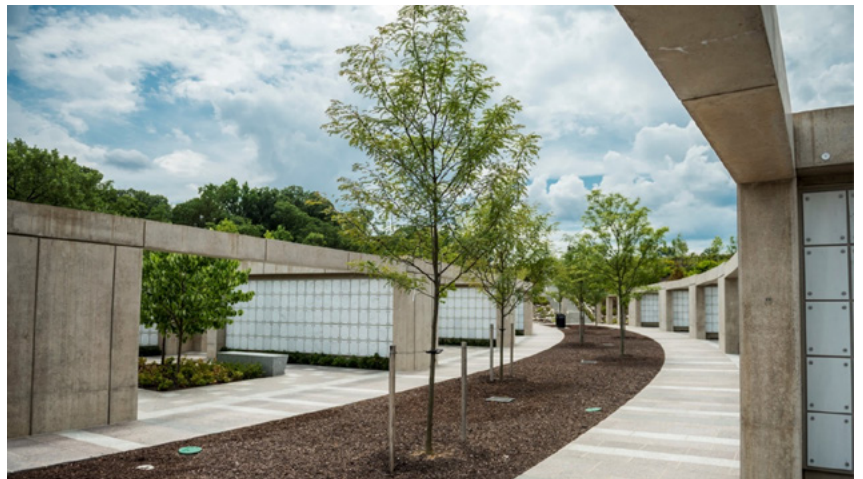
Figure 1: The original landscape design featured locust trees in Columbarium Courts 10 and 11.

In addition to ANC’s perfect rows of marble headstones, curving roads, and graceful trees, ANC has many beautiful, ecologically rich, and diverse landscape features including rain gardens designed for improving water quality and pollinator habitat in the Chesapeake Bay watershed. In fact, as a result of ANC’s high standards of professional practices deemed important for arboreta and botanic gardens, ANC received Level III Arboretum accreditation in 2018. Visitors, families of the fallen, and various dignitaries may catch a glimpse of a goldfinch, colorful insects, or various pollinators, such as butterflies, moths, and bees as they pass by these picturesque landscape features. Natural beauty provides a comforting and calming atmosphere for the bereaved, all while restoring the Chesapeake Bay.