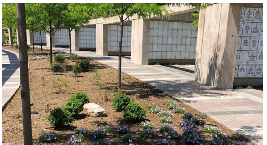
Figure 3: Phlox subulata offers a colorful groundcover.