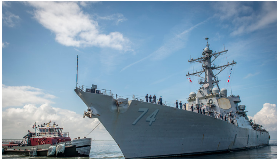
Naval Station Norfolk evacuating ships in preparation for Hurricane Florence in September of 2018.

It is recommended that dominant risks be addressed in Compatible Use Plans (CUPs), Integrated Natural Resource Management Plans (INRMPs), and other adaptation plans developed by installations.