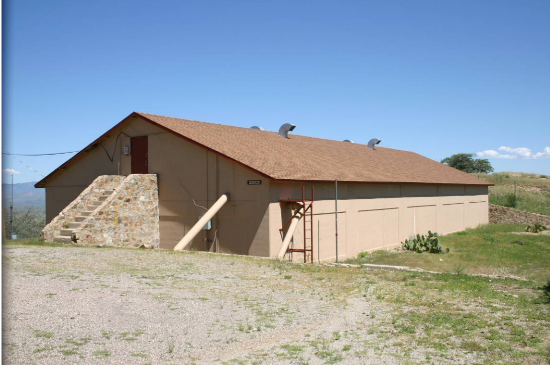
Figure 4-1. Reservoir No. 2 (22002).