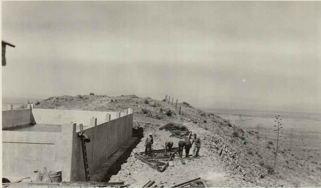
Iron workers assembling steel trusses for roof of 250,000 gallon reservoir.