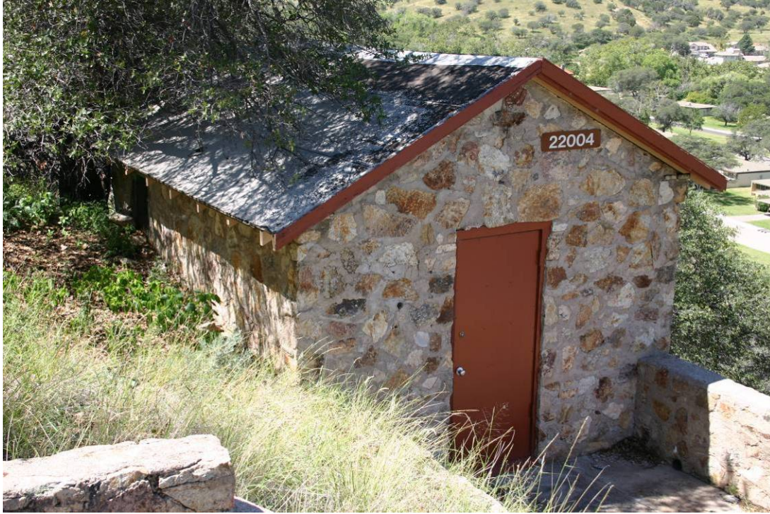
Figure 4-3. Water Treatment Plant (22004)