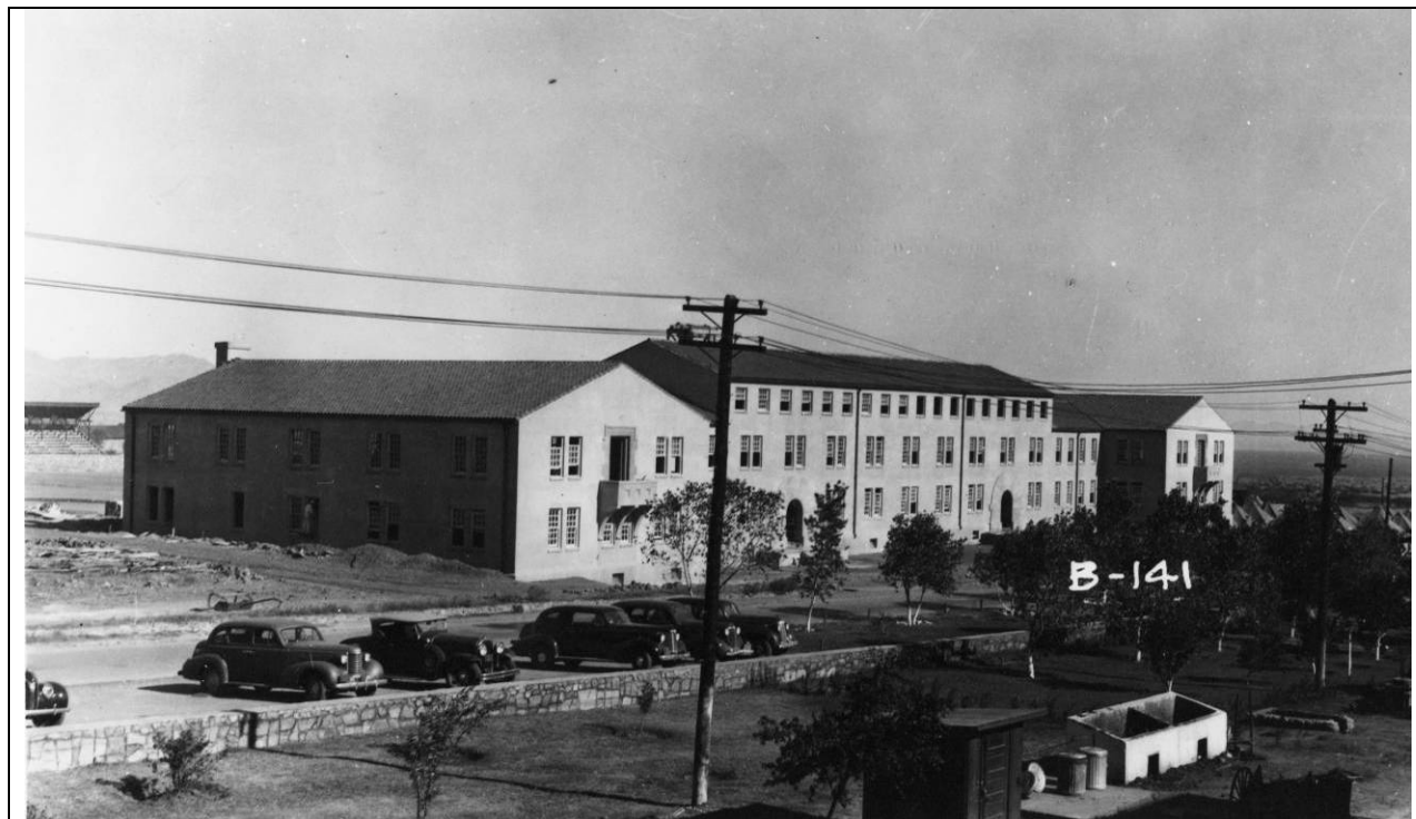
Figure 3-2. Million Dollar Barracks, 1938.

WPA and CCC projects completed at Fort Huachuca between 1936 and 1940 included some of the largest undertakings. The "Million Dollar Barracks" (31122), a three-story, poured concrete Spanish Colonial Revival structure, was completed in 1939 and is the most visible reminder of this period at Fort Huachuca (Van West 1997:305). Two new wells (Well No. 1 in 1936 and Well No. 2 in 1940) were drilled at the Emergency Landing Field (now the East Gate) and the success of Well No. 1 precipitated the construction of Reservoir No. 2 in 1939 on Reservoir Hill, which is the ridge overlooking the Old Post (Van West et al. 1997:305). Improvements to the officers' quarters along the parade ground were also made during this period (Van West et al. 1997:305). Grierson Street directly behind Officers' Row contains a number of WPA/CCC improvements including: stone garages for officers' automobiles, servants' quarters, retaining walls, and drainage ditches. Drainage ditches were also added to the front and rear of the row of the four double barracks fronting the north side of the parade ground.