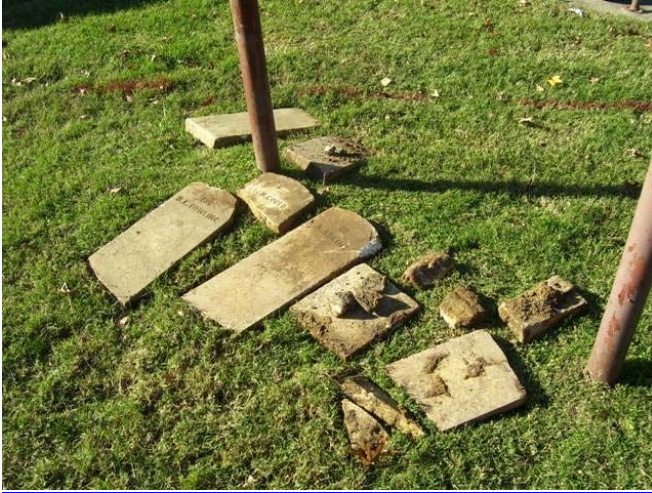
Photo of headstones unearthed at a Langley, AFB construction site.

October 24 th , 2006 began with business as usual at Langley AFB. Construction activities in Langley's Lighter-than-Air (LTA) housing area commenced to install a new sewer vacuum system near some vacant housing units. Suddenly, the backhoe hit something hard; the contractors, expecting to see a piece of concrete or stone, were surprised by a more disturbing find--two gravestones!