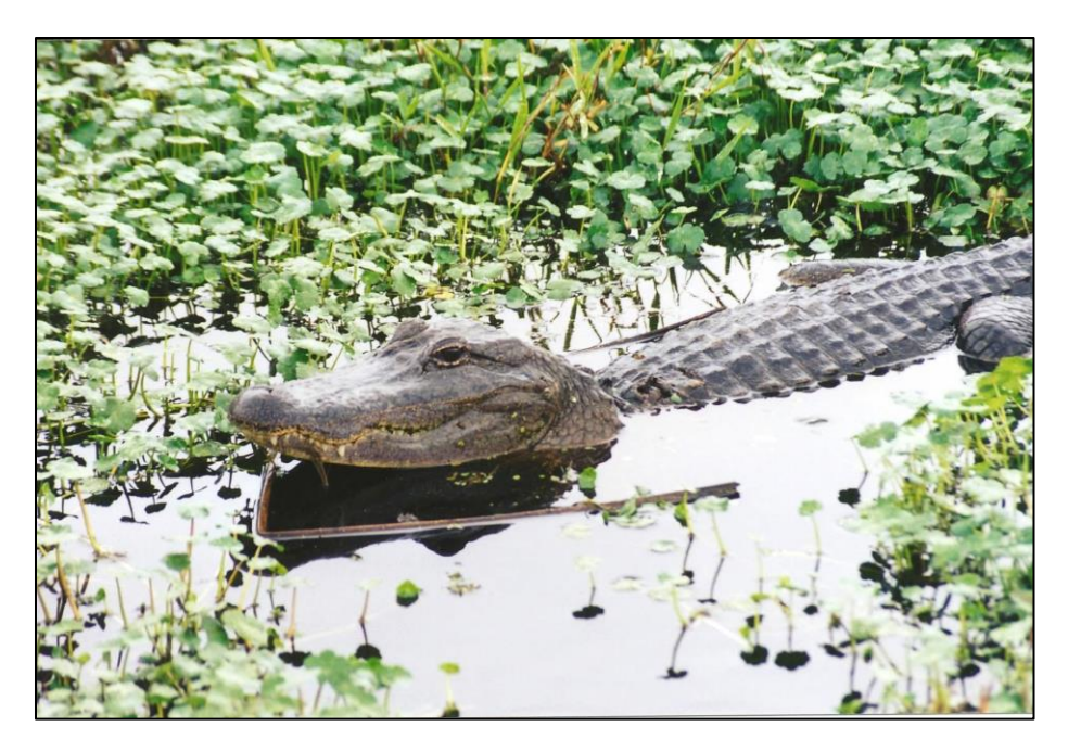
Figure 4-3. American Alligator

Marine Corps Base Camp Pendleton has the greatest number of federally-listed herpetofauna species confirmed on its installation (five species). Marine Corps Air Station Yuma (main base), MCAS Miramar, and MCB Quantico do not have any confirmed federally-listed species.