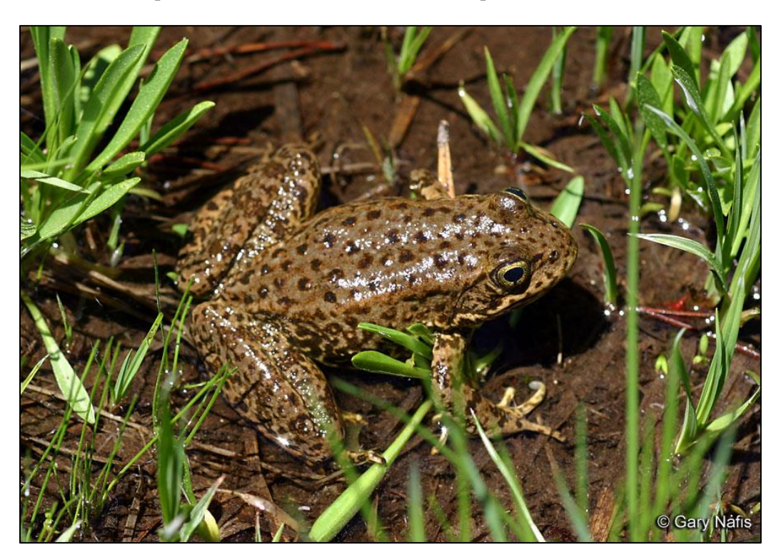
Figure 4-8. Sierra Nevada Yellow-Legged Frog

Seventeen species of reptiles and amphibians confirmed on Marine Corps installations have a NatureServe status of G1–G3—six lizards, five turtles, four frogs, one salamander, and one snake. Only one species has a status of G1–Critically Imperiled (Sierra Nevada Yellow-Legged Frog [ Rana sierra ]) which is confirmed on MCMWTC Bridgeport. Marine Corps Base Camp Pendleton has the greatest number of NatureServe species with a status of G1–G3 (seven species).