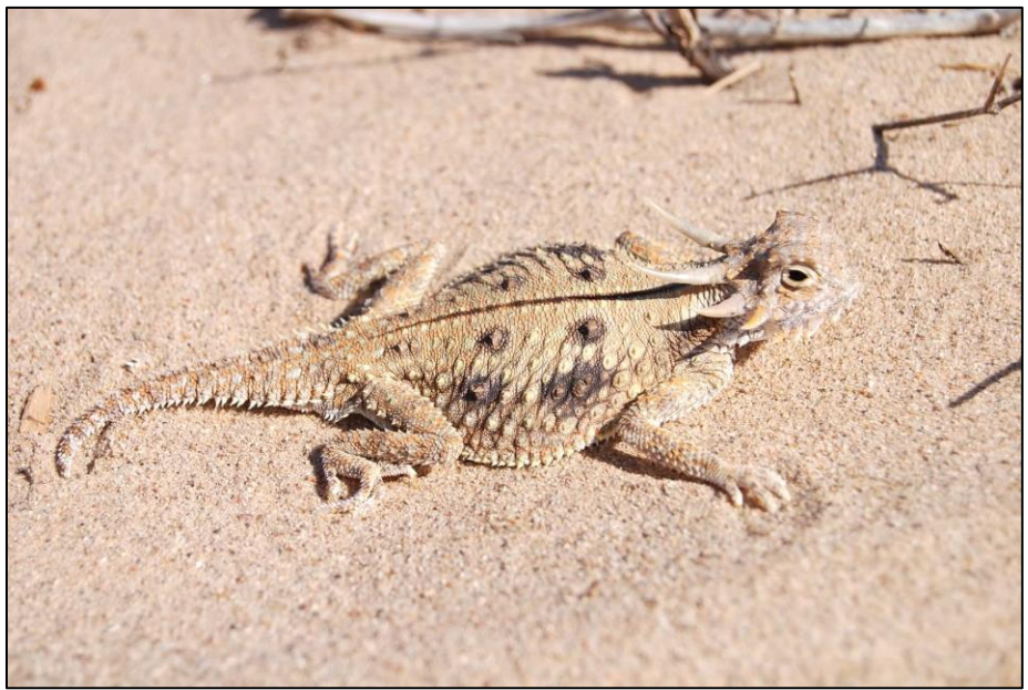
Figure 4-6. Flat-Tailed Horned Lizard