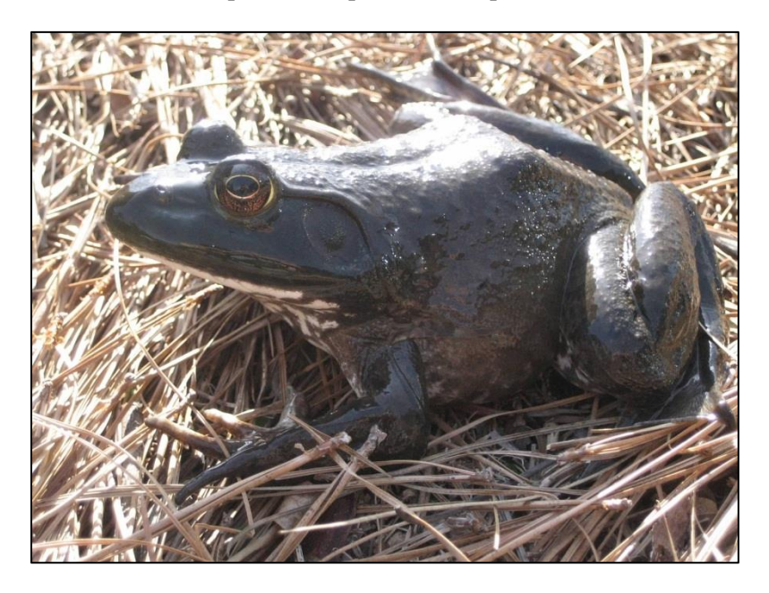
Figure 4-9. American Bullfrog

Six non-native amphibian and reptile species are confirmed on Marine Corps installations (table 5). Four of the species (the Spiny Softshell Turtle[ Apalone spinifera ], the Snapping Turtle [ Chelydra serpentine ], the Red-Eared Slider [ Trachemys scripta elegans ], and the American Bullfrog [ Lithobates catesbeianus ]) are native to the United States, but have been transported outside their natural range. The African Clawed Frog ( Xenopus laevis ) and the Mediterranean Gecko ( Hemidactylus turcicus ) are not native to the United States and are confirmed on MCAS Miramar and MCLB Albany respectively. Marine Corps Base Camp Pendleton has the most non-native herpetofauna species (four species).