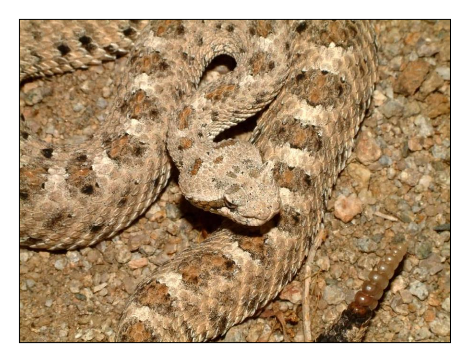
Figure 4-12. Sidewinder