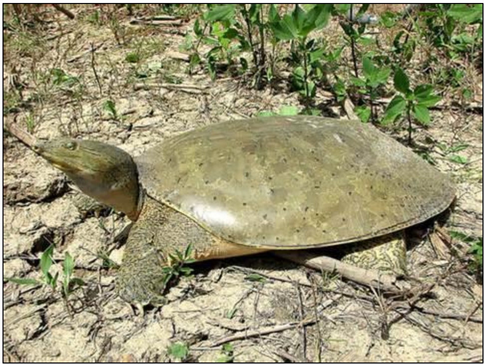
Figure 4-11. Eastern Spiny Softshell