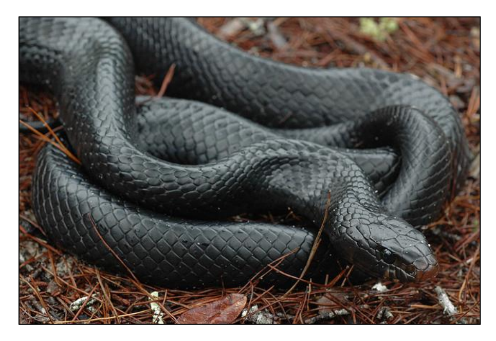
Figure 4-7. Eastern Indigo Snake

There are four species of amphibians and reptiles with the potential to occur on Marine Corps installations in states where they are listed as state-endangered or threatened. Of the species types, two are sea turtles (Kemp's Ridley Sea Turtle [ Lepidochelys kempii ], Hawksbill Sea Turtle [ Eretmochelys imbricate ]) one is a snake (Eastern Indigo Snake [ Drymarchon couperi ]), and one is a salamander (Striped Newt ( Notophthalmus perstriatus ]). All of the state-listed species with potential to occur on Marine Corps installations are located on the east coast of the United States.