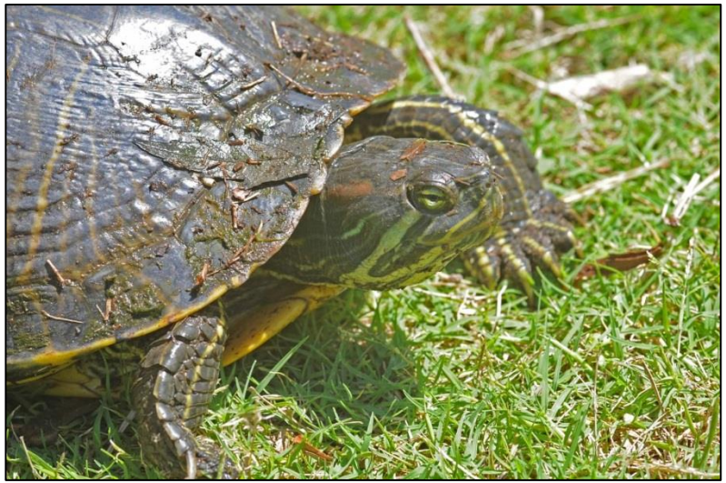
Figure 4-10. Red-Eared Slider

Seven additional non-native species have the potential to be present at Marine Corps installations. Three of these species (the Indo-pacific Gecko [ Hemidactylus garnotti ], the Greenhouse Frog [ Eleutherodactylus planirostris ], and the Cuban Treefrog [ Osteopilus septentrionalis ]) are not native to the United States. The remaining species are native to the United States, but have been transported outside their natural range.