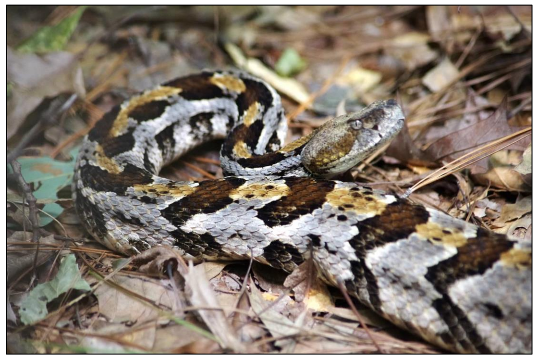
Figure 4-5. Timber Rattlesnake

There are fourteen species of amphibians and reptiles confirmed on Marine Corps installations in states where they are listed as state endangered or threatened (table 4). Of the species types, six are turtles, three are snakes, two are frog/toads, and there is one salamander, one lizard and one alligator. Marine Corps Base Camp Lejeune has the greatest number of state-listed threatened and endangered herpetofauna species (8 species).