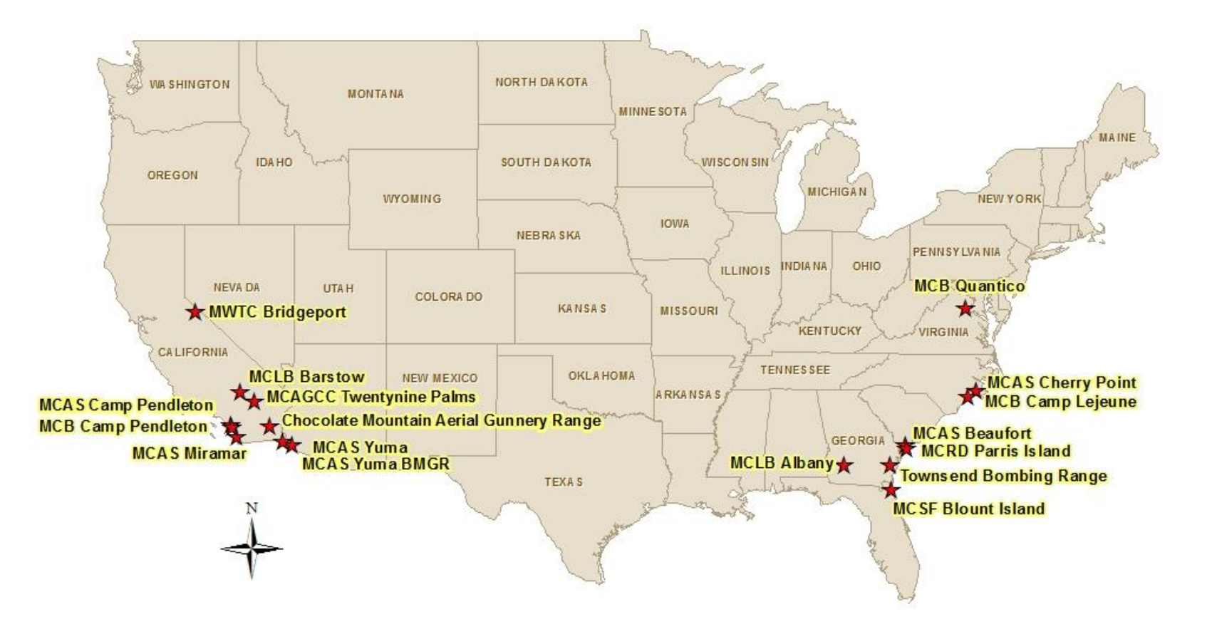
Figure 4-1. Marine Corps Installations Included in the Herpetofauna Inventory