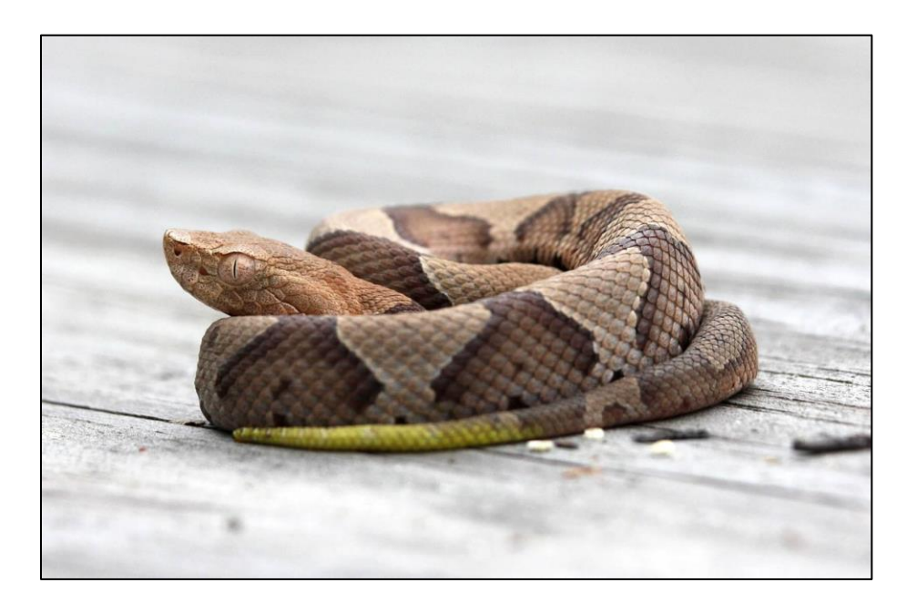
Figure 4-13. Copperhead Snake