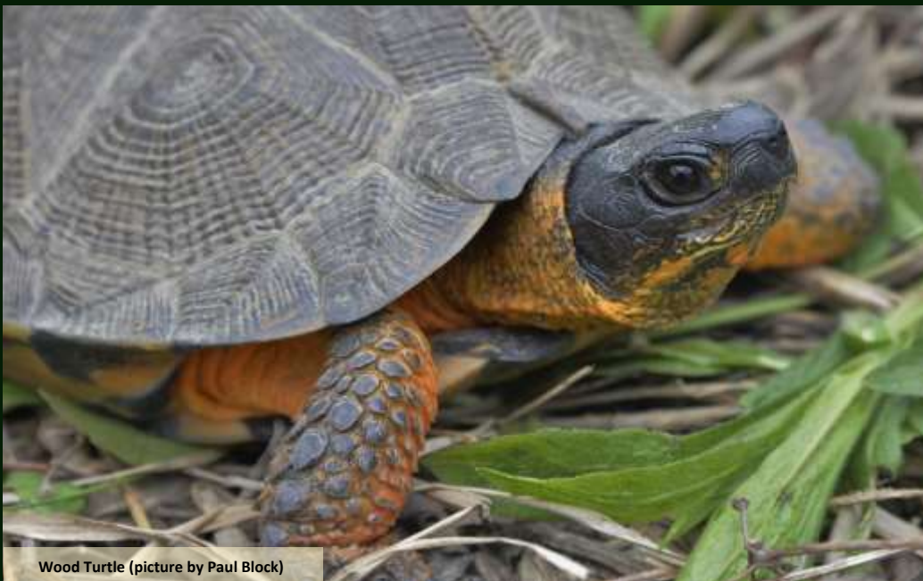
Wood Turtle

Educating military and civilian personnel about the herpetofauna on the military bases where they work and live is vital to successful species conservation. This year, we developed over 20 fact sheets on a variety of at-risk and common amphibian and reptile species confirmed on military lands. We will continue to create more fact sheets in 2018 as we work towards reaching our goal of developing a fact sheet for each of the 50 most common amphibian and reptile species confirmed present on military lands. Fact Sheets are distributed twice monthly through our listerv and are posted on the DoD Natural Resources Portal: http://www.dodnaturalresources.net/PARC-Resources.html .