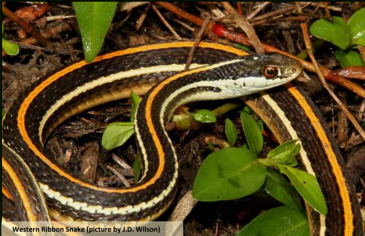
Western Ribbon Snake