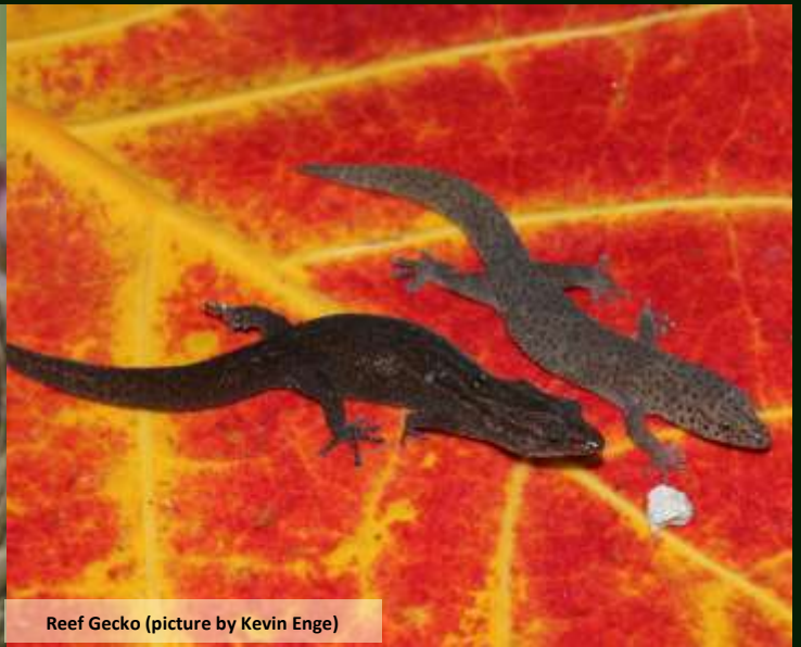
Reef Gecko