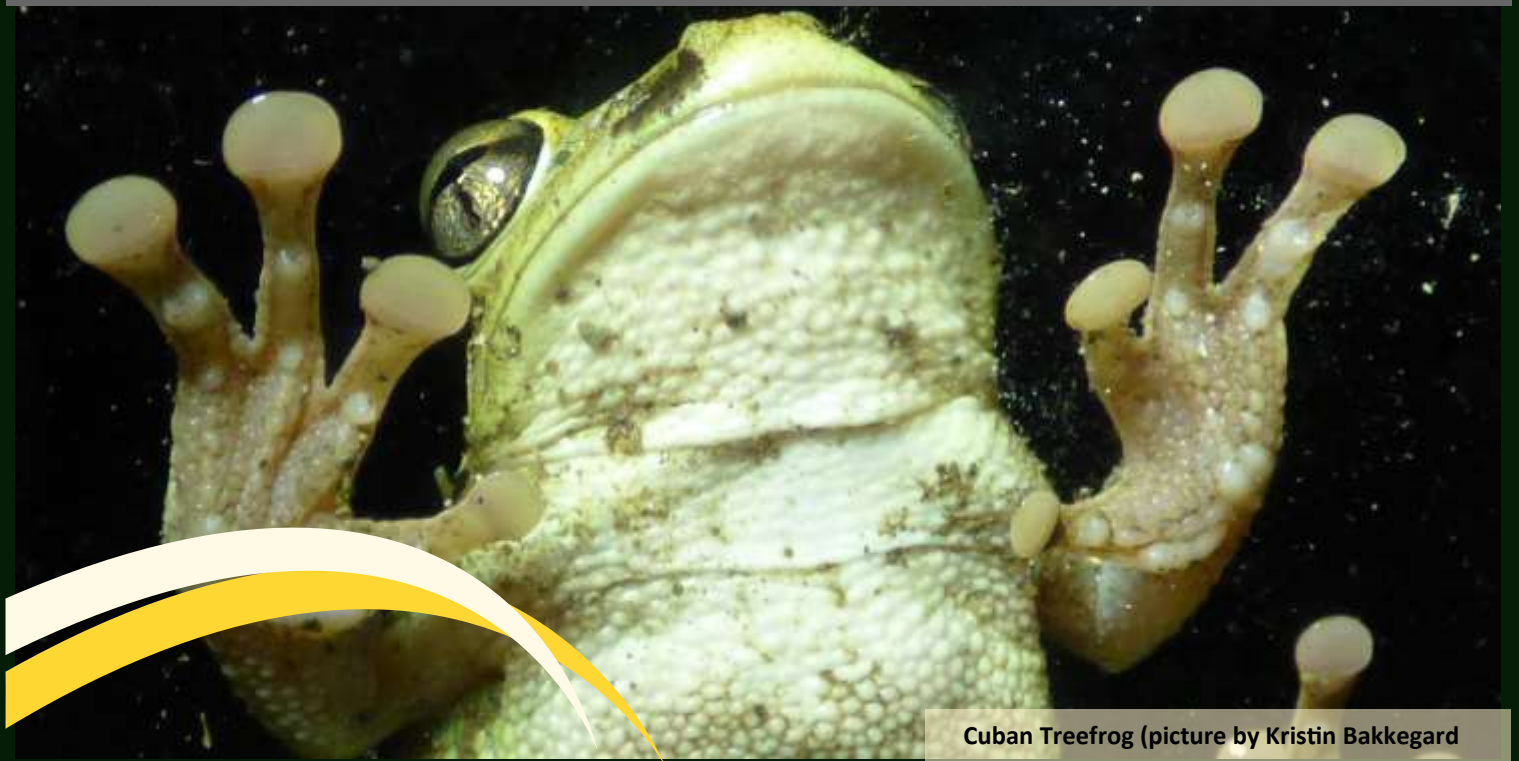
Cuban Treefrog

Thank you again for all your hard work this year. We look forward to your continued support in 2018!