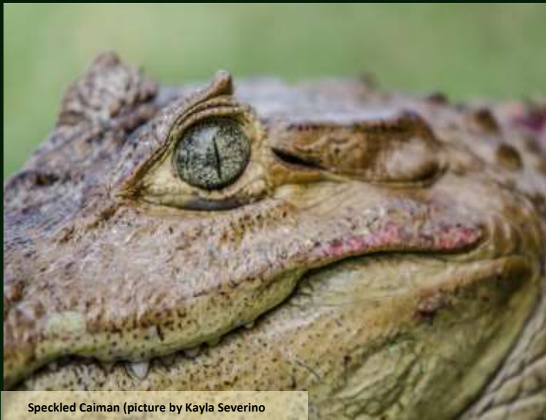
Speckled Caiman

We encourage you to sign up online ( https://www.herpmapper.org ) and download this very mobile mapper to your smartphone ( http://www.herpmapper.org/mobile/mapper ). We are looking forward to seeing the very interesting herpetofauna biodiversity records you add to HerpMapper.