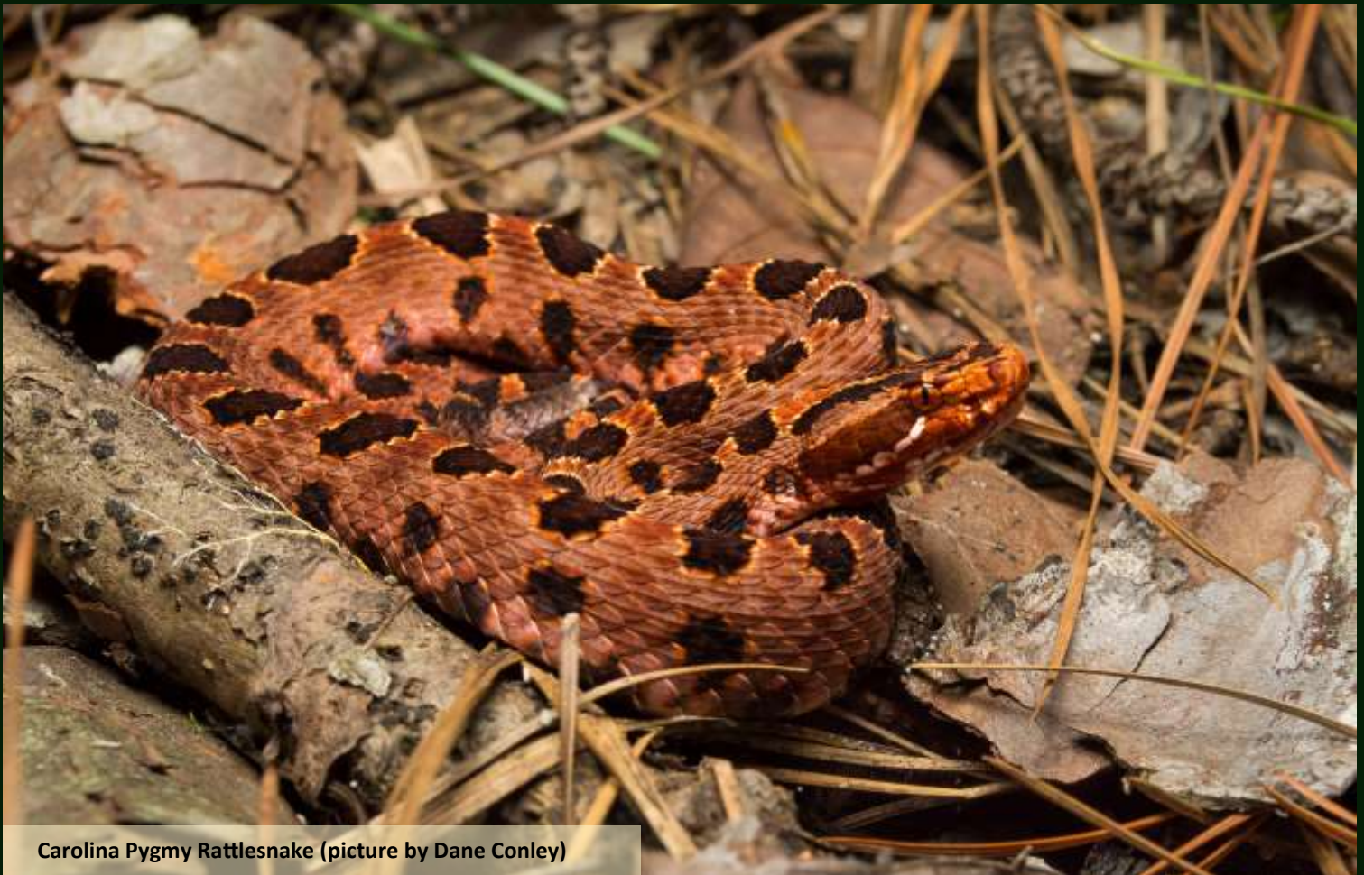
Carolina Pygmy Rattlesnake

Distributed in October 2017, this document contains a DoD-specific list of herpetofauna species that are federally-listed, state-listed, NatureServe G1/T1-G3/T3, and/or are currently petitioned or under review for listing by the U.S. Fish and Wildlife Service (USFWS). Species on this list have been confirmed present on military installations. This list is intended to serve as an informational tool that DoD resource managers and military leadership can use to help plan, prioritize, and budget for relevant conservation and management actions in ways that best meet installation needs.