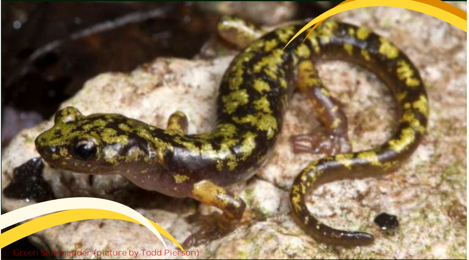
Green Salamander