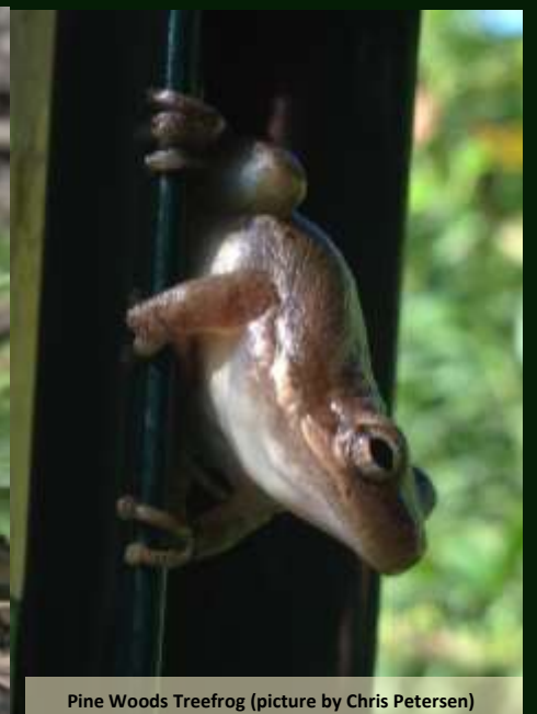
Pine Woods Treefrog