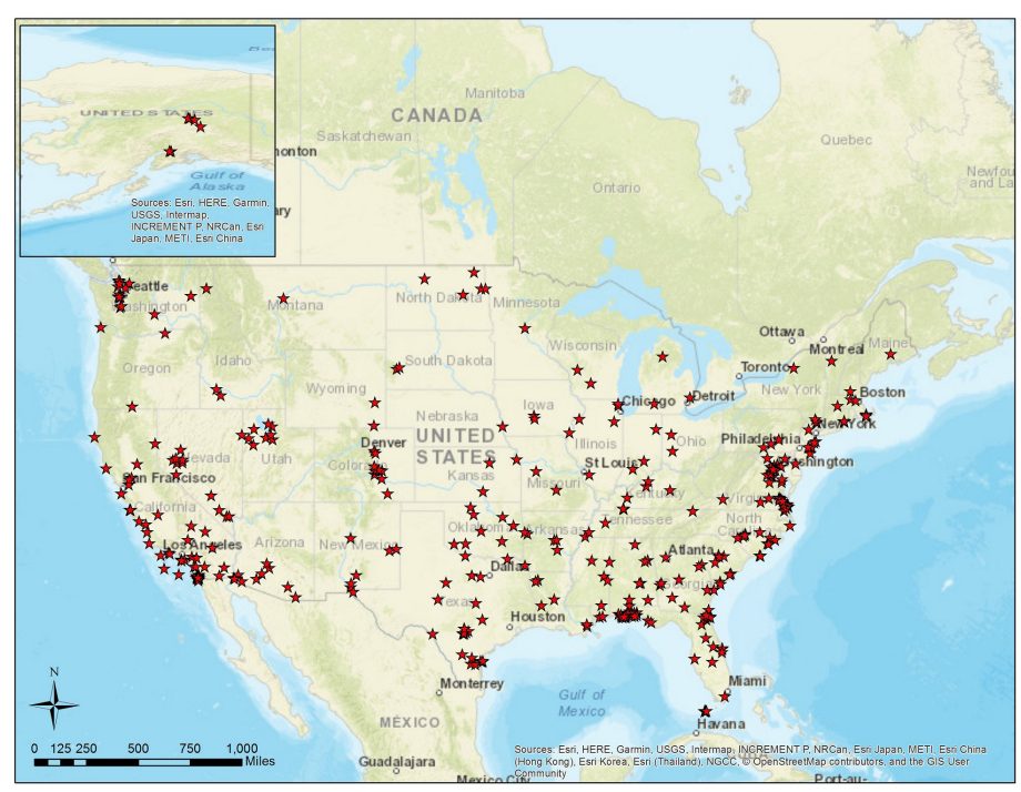
FIGURE 1. Location of U.S. Department of Defense (DoD) properties included in the amphibian and reptile inventory.

report-input [Accessed 2013–2016]). The following six ESA designations were added to the inventory for listed species: Under Review; Candidate; Proposed; Similarity of Appearance-Threatened; Threatened; Endangered. Under Review species included species that have been petitioned for listing for which a 90-d finding has not been published and species that have been petitioned for listing for which a 90-d finding has been published, but for which a 12-mo finding had not yet been published in the Federal Register. State-listed (endangered or threatened) status designations were added to the inventory using an updated version of Nanjappa and Conrad (2011). We updated these data in 2017 and had the update reviewed and validated by state wildlife professionals before being added to the dataset. We obtained NatureServe conservation status rankings for each species using NatureServe Explorer (Available from http://explorer.natureserve.org/ [Accessed 2013-2016]). NatureServe assigns rounded global conservation status rankings on a scale of G1 to G5 (T1 to T5 for subspecies). In this paper, we define species/subspecies with a NatureServe conservation ranking of G1/T1-G3/ T3 as an At-risk species.