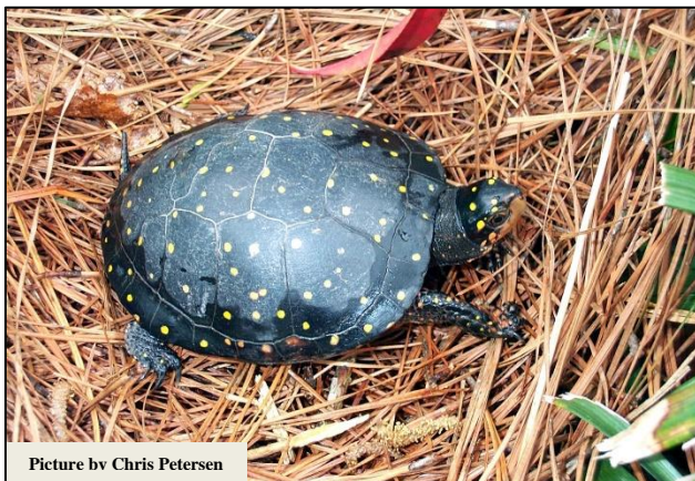
Figure 1. Female spotted turtle carapace

Description: Adults are typically 3.5 to 4.5 inches (8.9 to 11.4 cm) in length. Spotted turtles have a smooth black carapace (top shell) with scattered round yellow spots and a tan-to-yellow plastron (bottom shell), which may have large brown-to-black patches (Figures 1,2). The head and neck are black and may have reddish-orange to yellow blotches that end behind the eye and do not continue to the jawline. The forearms may also be bright orange (Figure 3), a feature that can fade seasonally. Males typically have brown eyes, brown jaws and slightly concave plastrons. Females typically have orange eyes, orange jaws and flat plastrons. Hatchling turtles usually have one yellow spot on each plate. Adults may lose carapace spots over time but usually retain some markings on the head and neck.