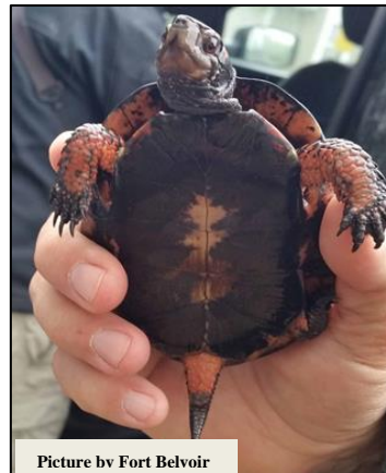
Figure 2. Spotted turtle plastron