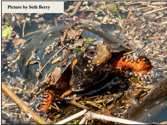
Figure 3. Orange forearms of a male spotted turtle

Range: The spotted turtle inhabits the Atlantic coastal lowlands and foothills from Maine to northern Florida. This species also occupies parts of the Great Lakes region of Canada and the United States, occurring from the southern tip of Lake Michigan to the St. Lawrence River valley, as well as the upper reaches of the Ohio River system (Figure 4).