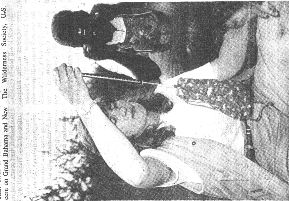
BIOLOGISTS with the United States Fish and Wildlife Service are seen demonstrating bird banding and measuring techniques.