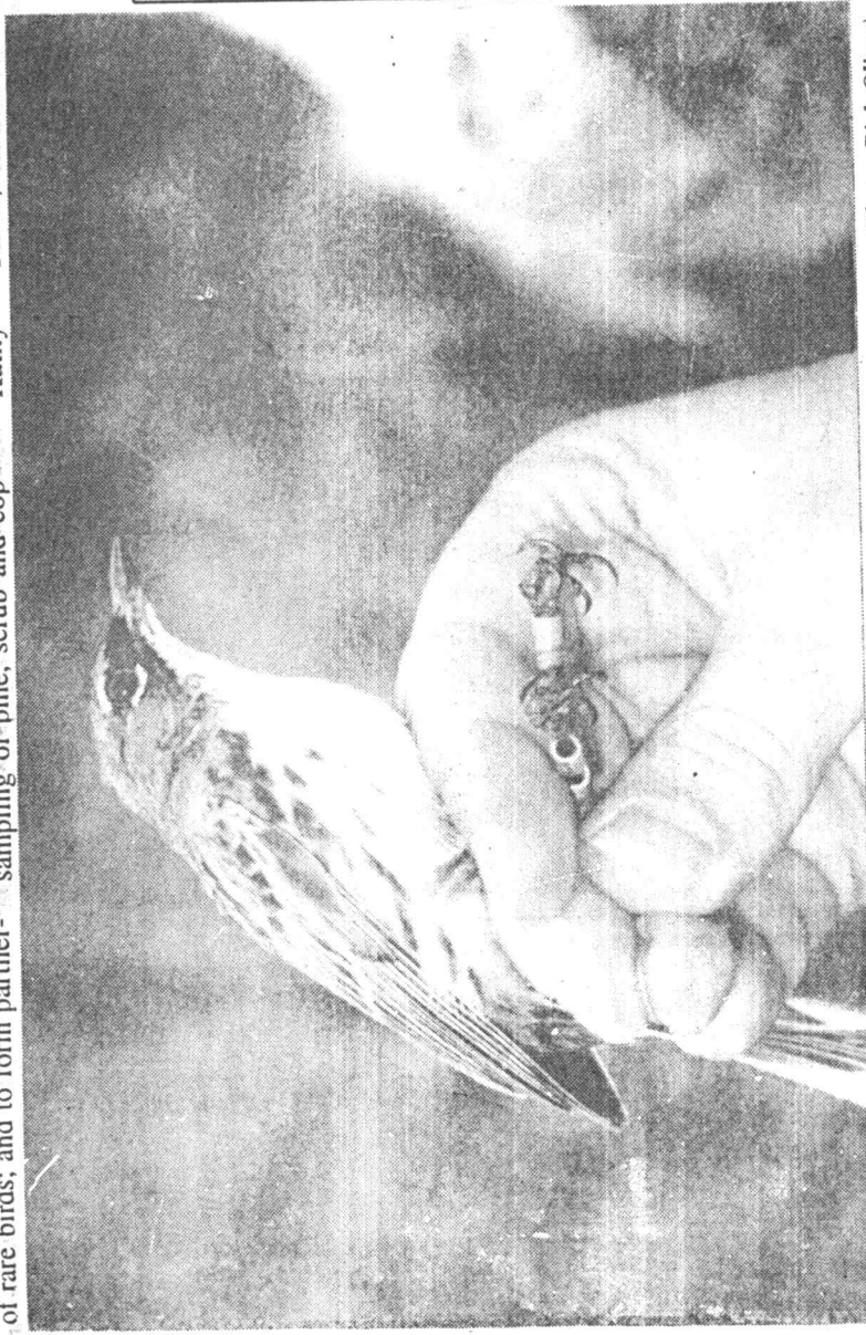
THE KIRKLAND'S WARBLERS showing identification bands around the legs.