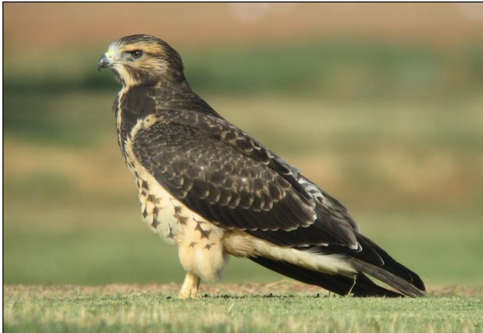
Checklist of Birds

Dyess AFB occupies 6,342 contiguous acres and is located in the north central portion of Taylor County Texas and forms part of the western boundary of the city of Abilene. Abilene is approximately 150 miles west of the Dallas-Fort Worth metropolitan area. The northwest and eastern perimeters of the base are primarily bordered by residential development with the remainder adjacent to agricultural land.