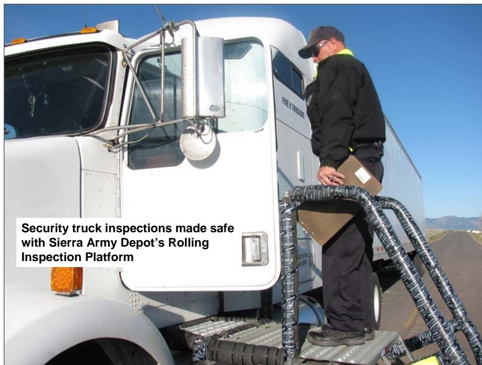
Security truck inspections made safe with Sierra Army Depot's Rolling Inspection Platform