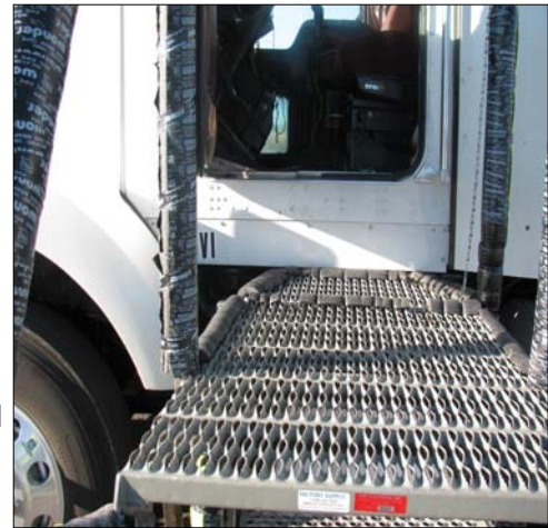
Easy access to driver's side door with the left side hand rail removed.