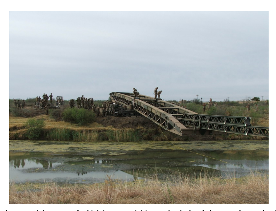
All environmental documents for high impact activities need to be handed over to the rotating forces.

It must be understood that, depending on the time frame of the mission, forces may be rotated where activities similar to those explained otherwise in this guidebook, will have to be implemented in terms of mobilisation, handing and taking over as well as demobilisation. A detailed Force Rotation Plan covering environmental functions and responsibilities, procedures for matériel, personnel, and contract management as well as authorization for liaison with the host nation must be in place before the rotation of forces can be implemented.