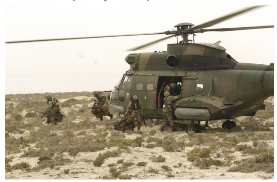
Detailed planning will ensure mission success the moment forces arrive in the area of operations.

The deployment phase entails all activities from the moment forces have been declared mission ready and includes the movement of forces to the area of deployment, the physical execution of the mission, rotation of forces as well as more detailed activities that might take place during these actions.