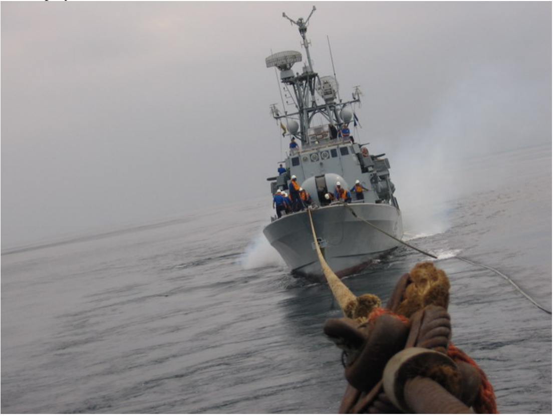
Re-deployment planning is as important as all other planning phases.

Demobilisation and return of forces and equipment, as well as the transfer of infrastructure to the host nation, takes place during this phase. In order to ensure control over management liabilities the following aspects need to be considered: