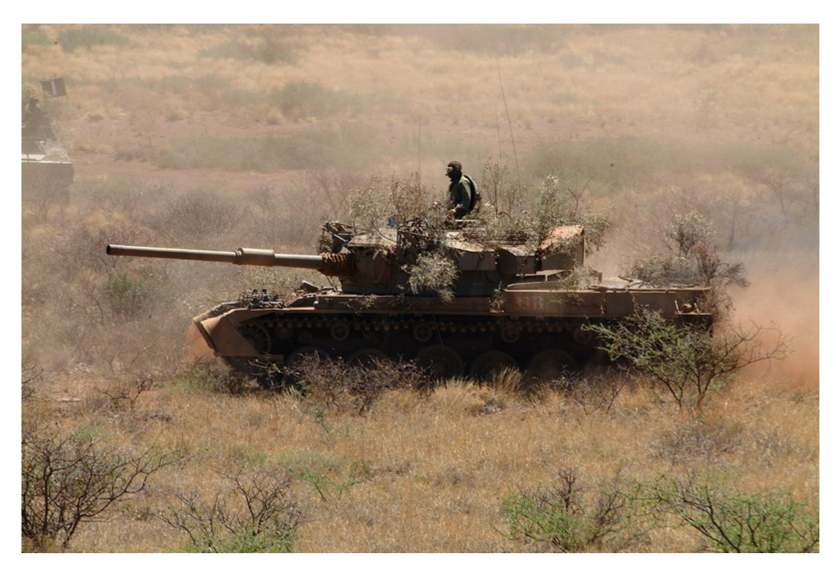
Military operations, by their very nature, can have major impacts on the environment.

The purpose of this guidebook is to identify and describe processes for integrating environmental considerations into the planning and implementation process for Peace Support Operations (PSO). Appendices to this guidebook provide formats and guidance for input into Orders Appreciation and Production Process, as well as standard reporting formats for use during the life cycle of the mission.