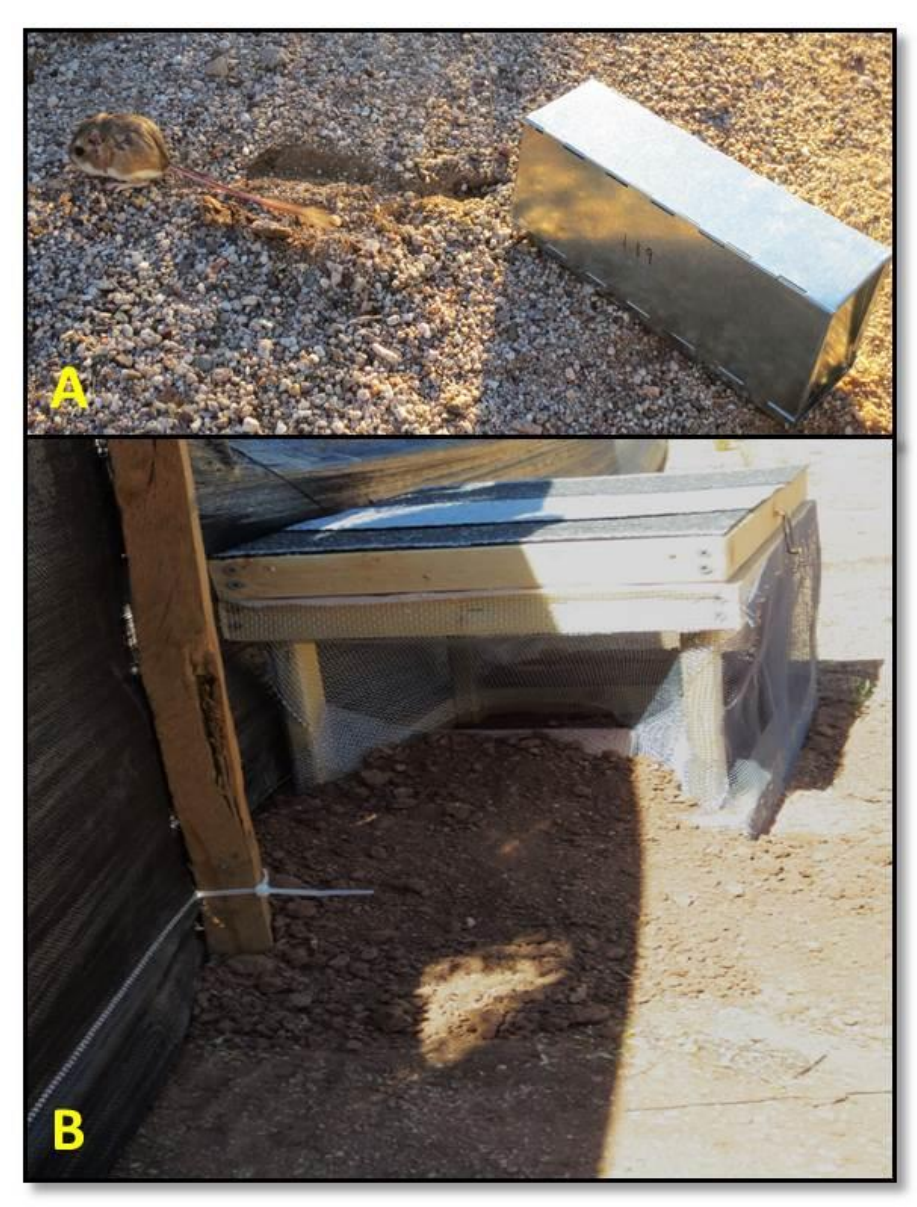
Figure 1 . Sherman live trap (A) for small mammals and reptile box trap along a drift fence (B) used to conduct field work.